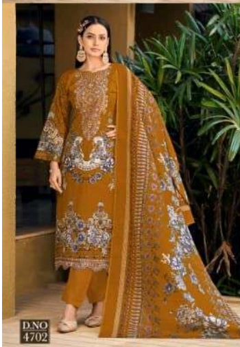
EMBROIDERY : Kashmiri Heavy Neck & Daman With Stich