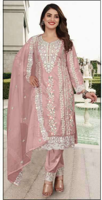
CODE: R-1107 D