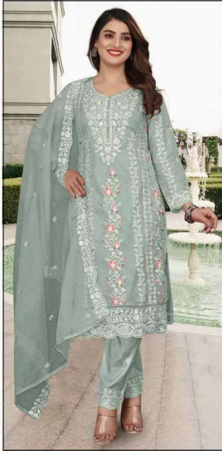
CODE: R-1107 A

TOP- ORGANZA WITH EMBROIDERY WITH KHATLI WORK BOTTOM- VISCOSE SILK DUPATTA- ORGANZA WITH EMBROIDERY