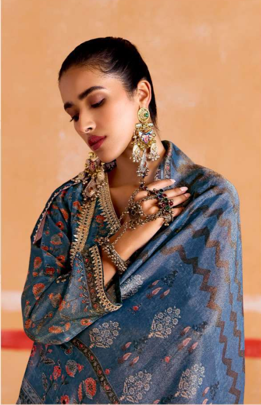
9544 Style is the way you carry your dress with confidence and charm.