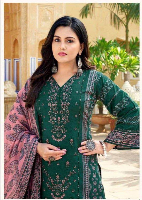
The dress must follow the body of a woman — not the body following the shape of the dress