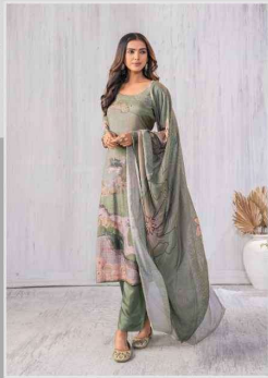
Barkha 9075 C