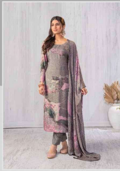
Barkha 9075 B