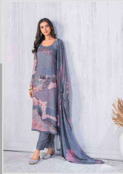
Barkha 9075 D

*** Draped in Heritage, Styled with Grace ***