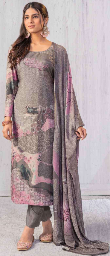
Barkha 9075 B