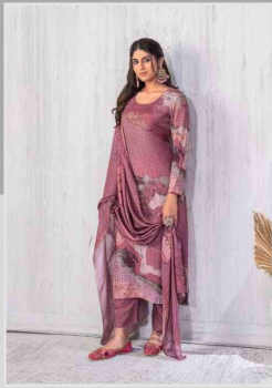
Barkha 9075 A