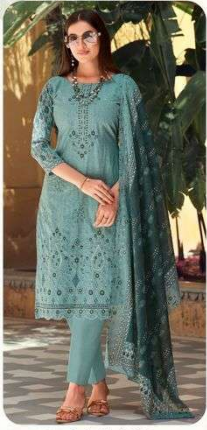
●●● Style No./ 1901