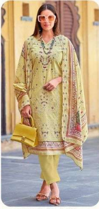
●●● Style No./ 1903