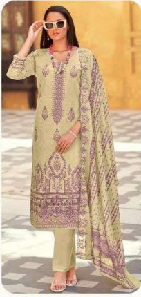
●●● Style No./ 1906