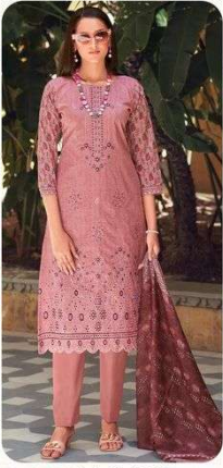
●●● Style No./ 1902