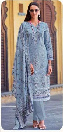
●●● Style No./ 1904