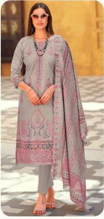
●●● Style No./ 1905