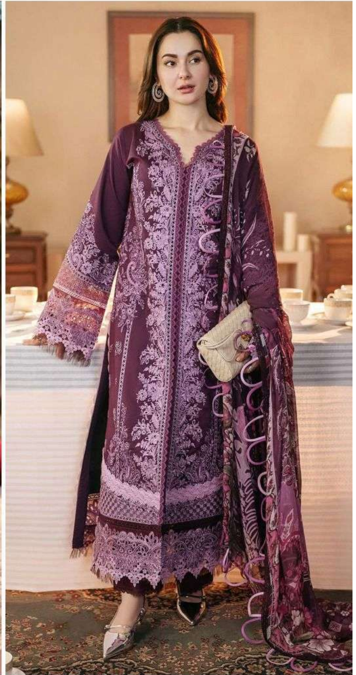
D NO 26002

TOP:- PURE COTTON WITH HEAVY EMBROIDERY CHIKANKARI WORK BOTTOM:- COTTON DUPATTA:- MUSLIN COTTON WITH DIGITAL PRINT