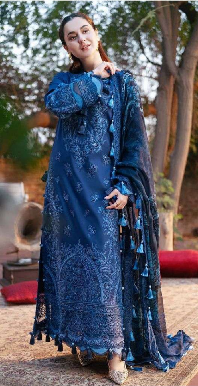
D NO 26001