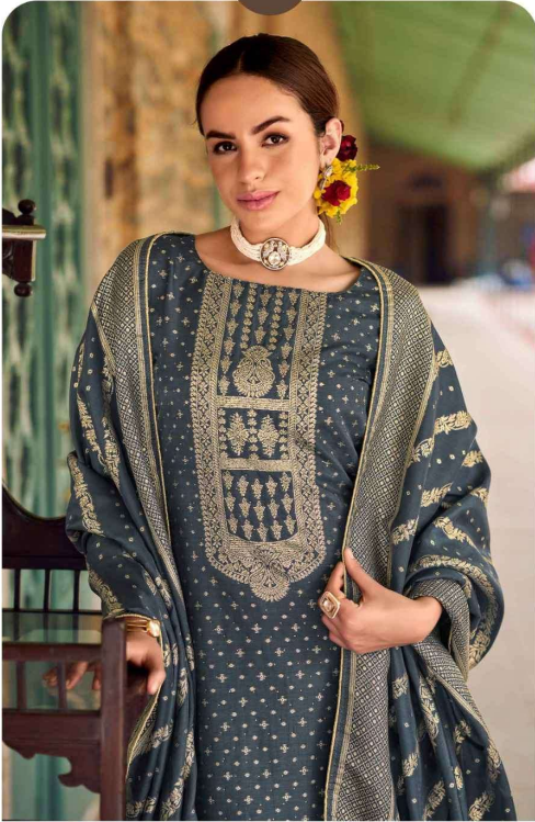
Inspired by history, designed for now. A modern silhouette with an ethnic vow. Fabrics that flow like a river's song. In every dress, the roots stay strong.