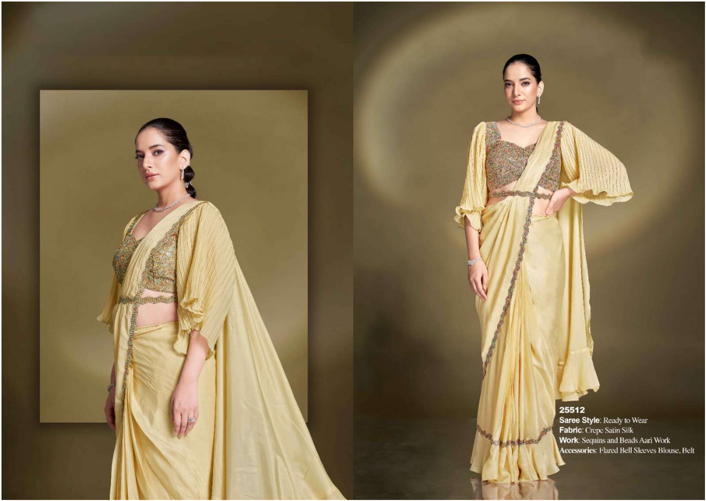
25512 Saree Style: Ready to Wear Fabric: Crepe Satin Silk Work: Sequins and Beads Aari Work Accessories: Flared Bell Sleeves Blouse, Belt