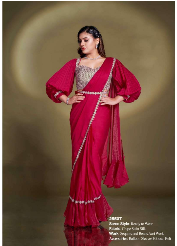
25507 Saree Style: Ready to Wear Fabric: Crepe Satin Silk Work: Sequins and Beads Aari Work Accessories: Balloon Sleeves Blouse, Belt