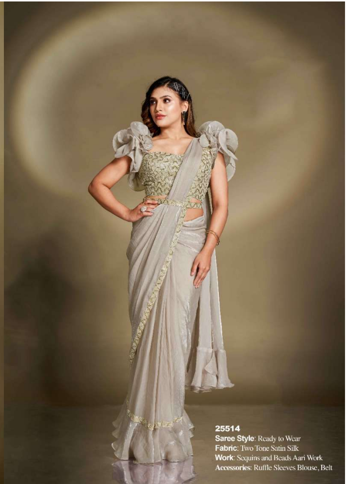
25514 Saree Style: Ready to Wear Fabric: Two Tone Satin Silk Work: Sequins and Beads Aari Work Accessories: Ruffle Sleeves Blouse, Belt