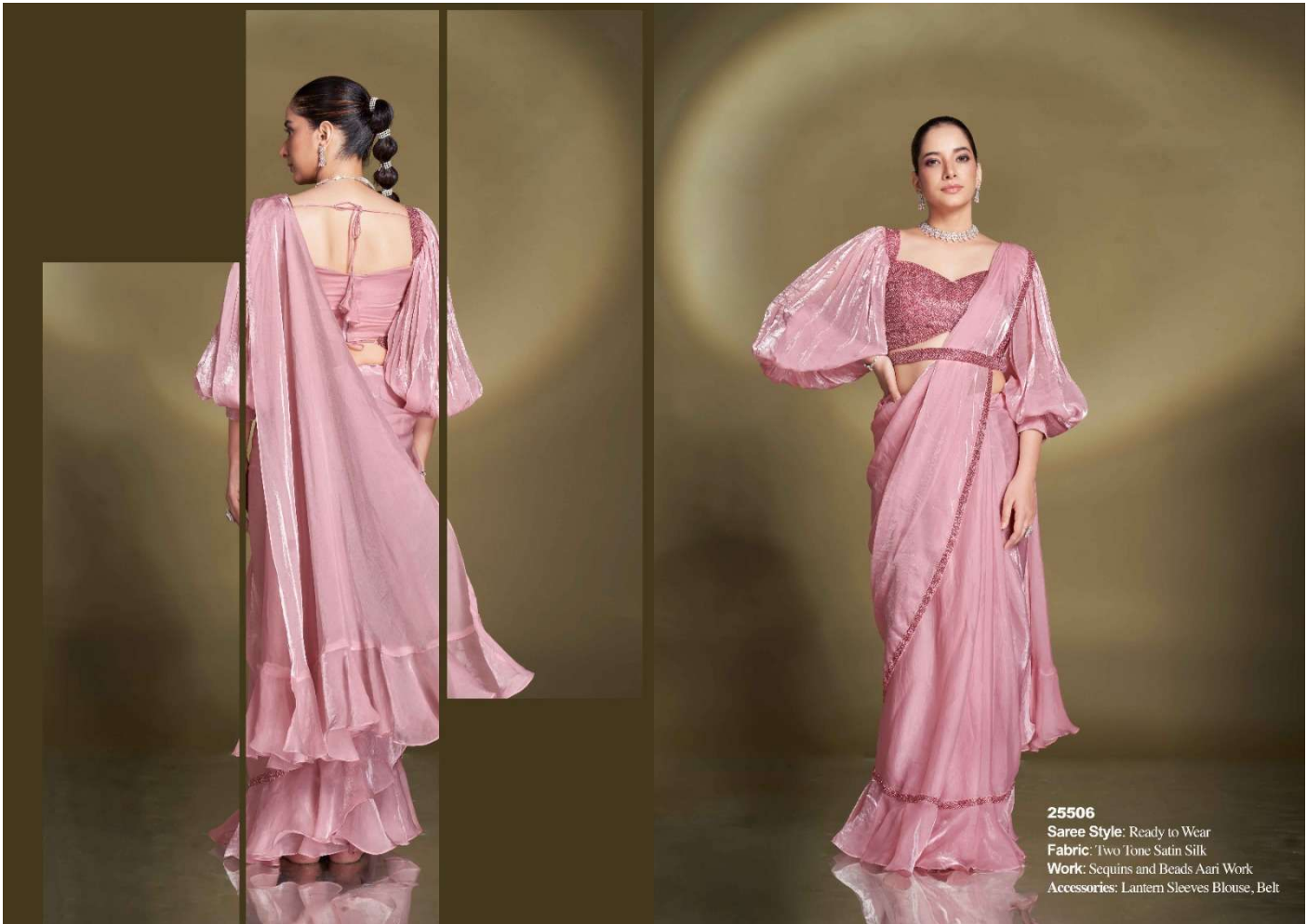
25506 Saree Style: Ready to Wear Fabric: Two Tone Satin Silk Work: Sequins and Beads Aari Work Accessories: Lantern Sleeves Blouse, Belt