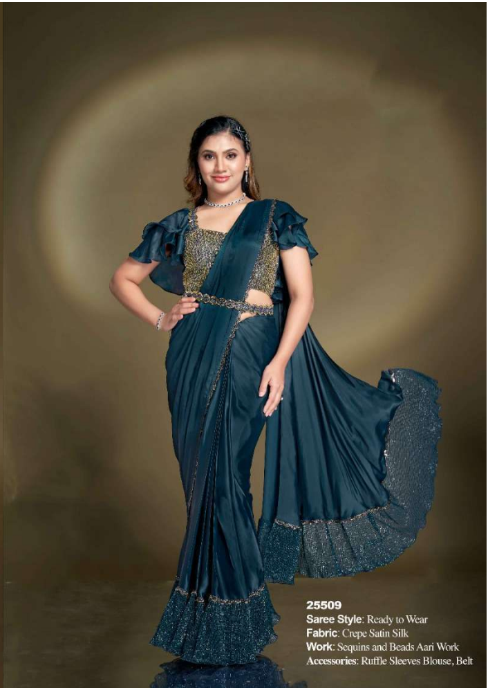
25509 Saree Style: Ready to Wear Fabric: Crepe Satin Silk Work: Sequins and Beads Aari Work Accessories: Ruffle Sleeves Blouse, Belt