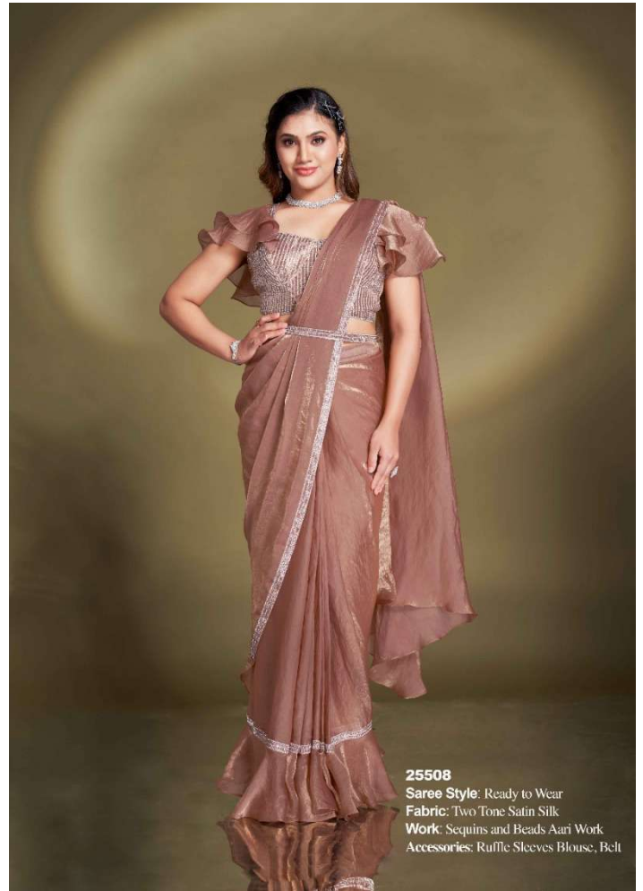
25508 Saree Style: Ready to Wear Fabric: Two Tone Satin Silk Work: Sequins and Beads Aari Work Accessories: Ruffle Sleeves Blouse, Belt