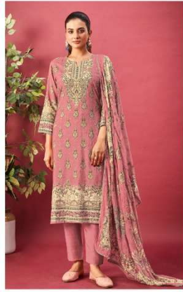
D.NO - 302