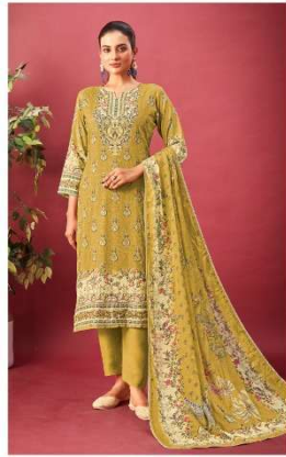
D.NO - 304