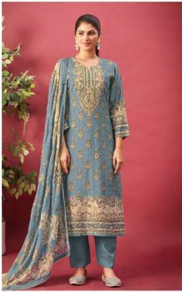
D.NO - 303