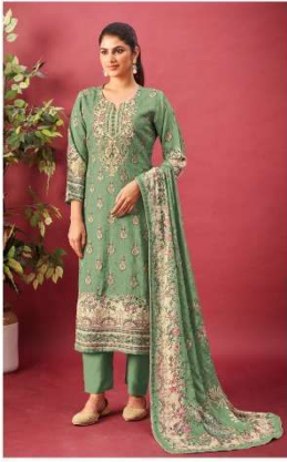
D.NO - 301