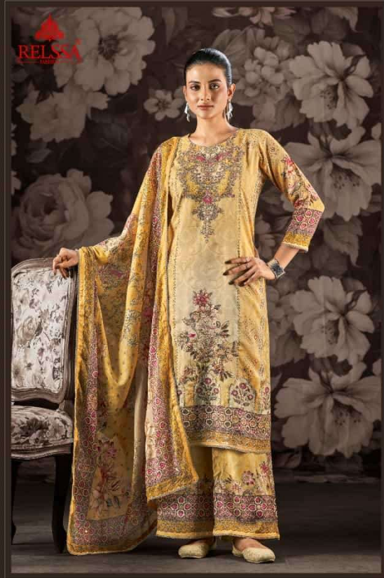
D.NO : 502