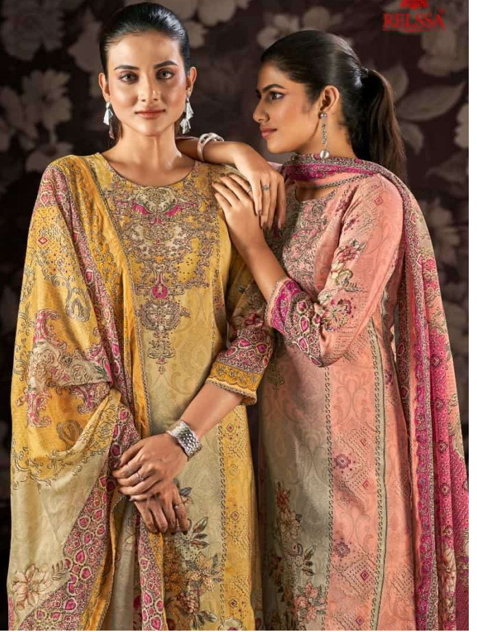
D.NO : 503