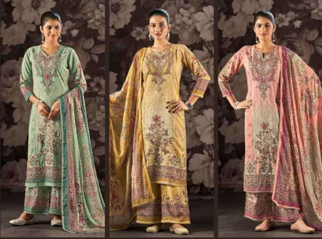
D.NO : 501