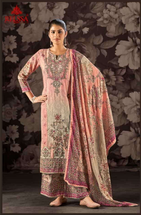
D.NO : 503