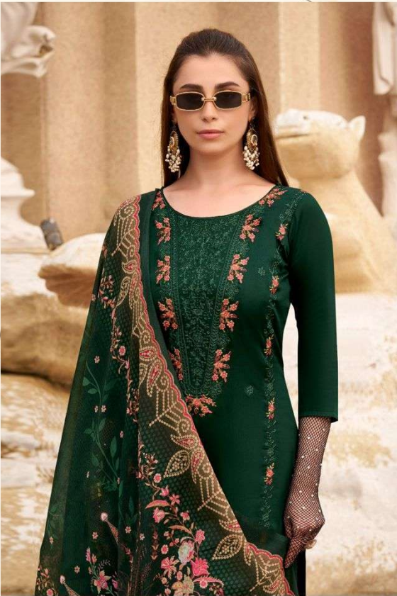
Make your day more exquisite with this exclusive ready to wear dress to grace all occasions. 890-002