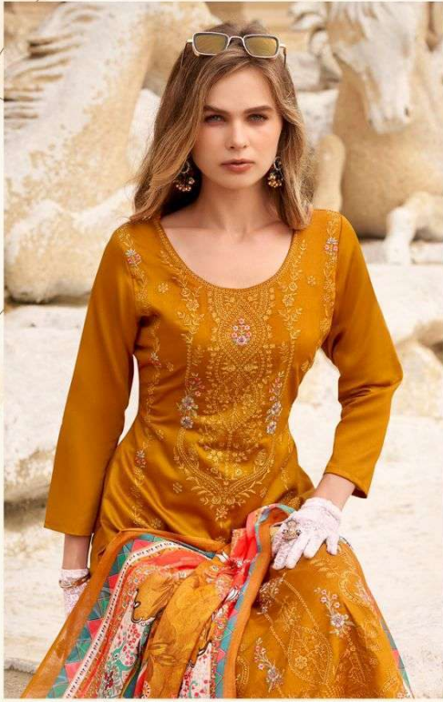
Make your day more exquisite with this exclusive ready to wear dress to grace all occasions.