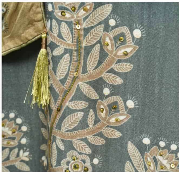
sample without letting so of elegance & tradition with natural trends.