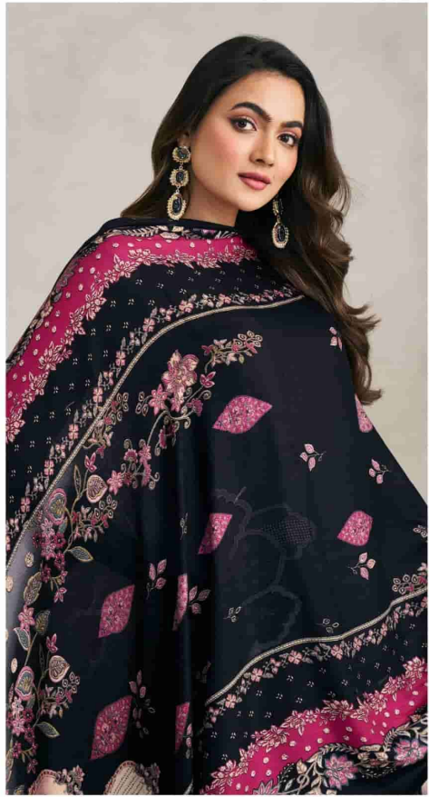
Classic styles with luxurious soft fabrics are highlighted by refined and feminine details