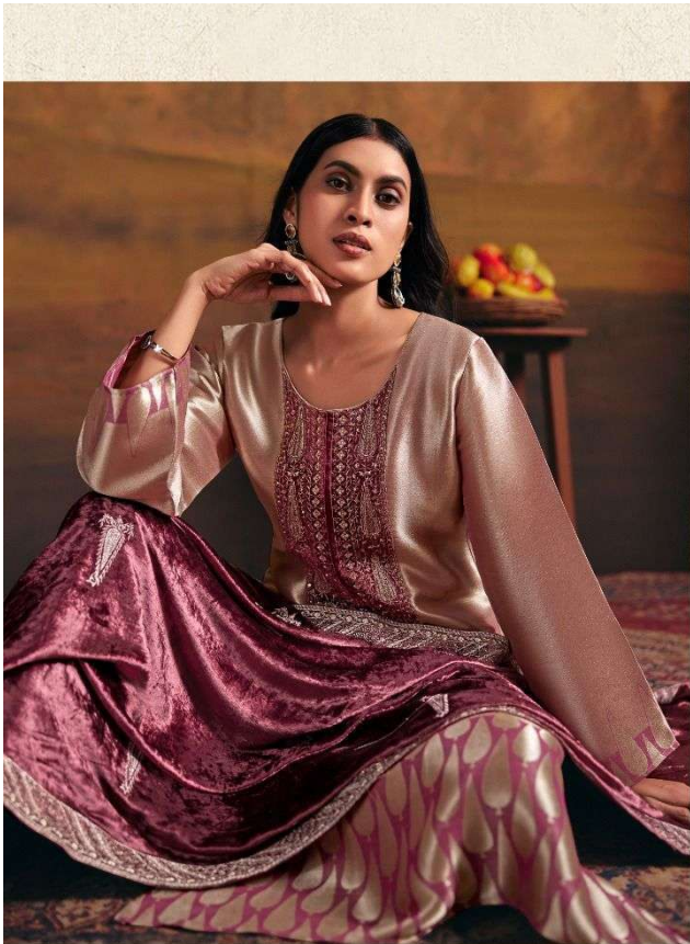
11568 This attire mirrors your charm, where fashion meets elegance in the most stunning way. Your presence turns this outfit into a timeless fashion statement.