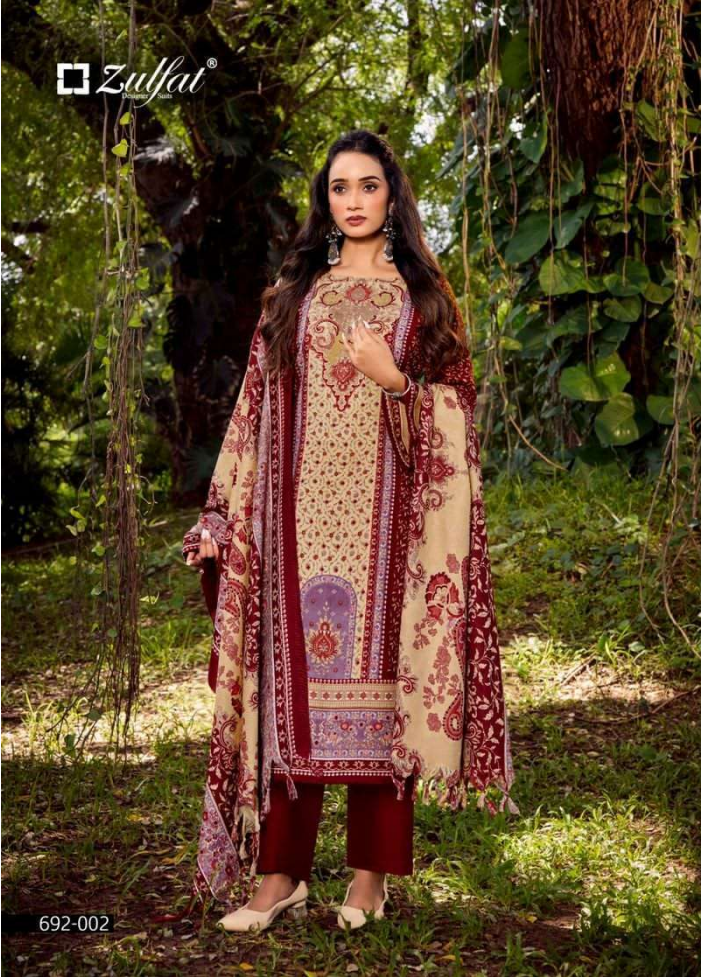
Exotic fabric that looks radiant in both an elegant drape or a flirtatious careless wrap.