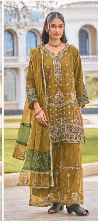
D~ 3225 C