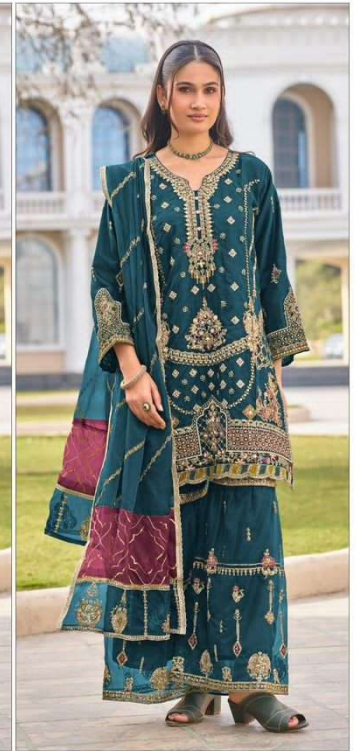
D~ 3225 D