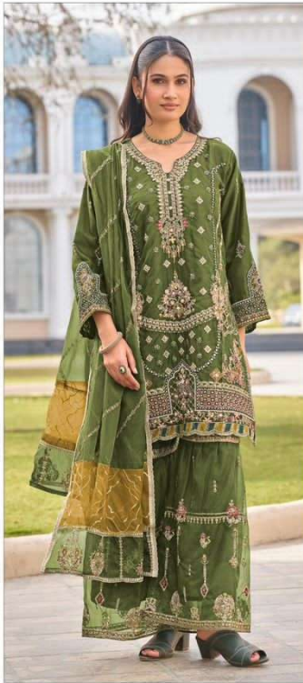
D~ 3225 A