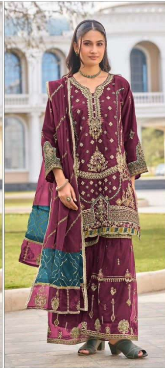
D~ 3225 B