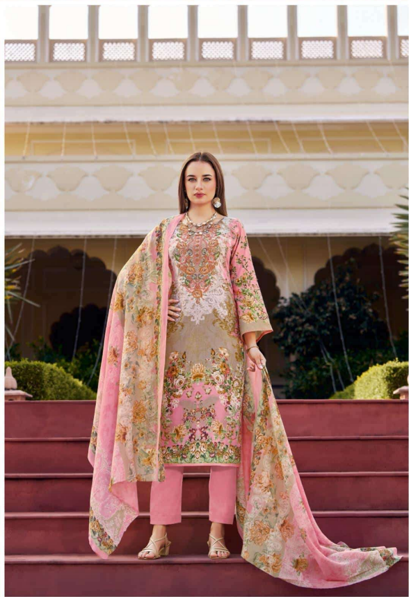
Dressing well is a form of self-love and good manners, and I want to showcase that with my style