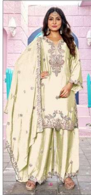
S - 1223 C