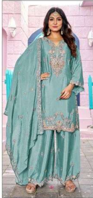
S -1223 B