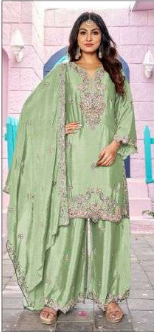
S - 1223 A

Top:- FLUTT silk heavy Embroidery work with bits khatli work Plazo :- FLUTT silk heavy Embroidery work with bits khatli work Dupatta - FLUTT silk heavy Embroidery work with bits khatli work Inner :- heavy cheap