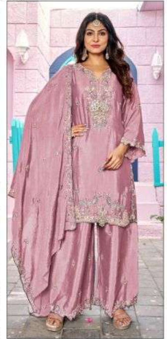
S - 1223 D