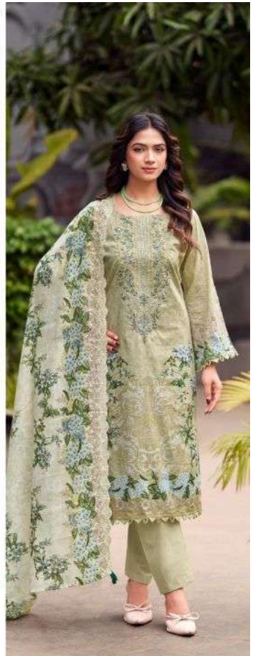
⊗ DUPATTA ⊗ COTTON MALMAL PRINTED 2.25 MTR APPROX

⊗ BOTTOM ⊗ : LAWN COTTON DYED 2.5 MTR APPROX