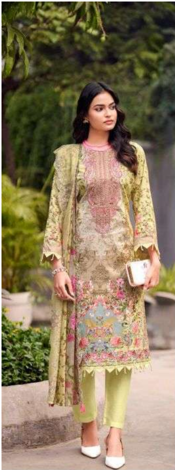
⊗ TOP ⊗ LAWN COTTON DIGITAL PRINT 2.5 MTR APPROX