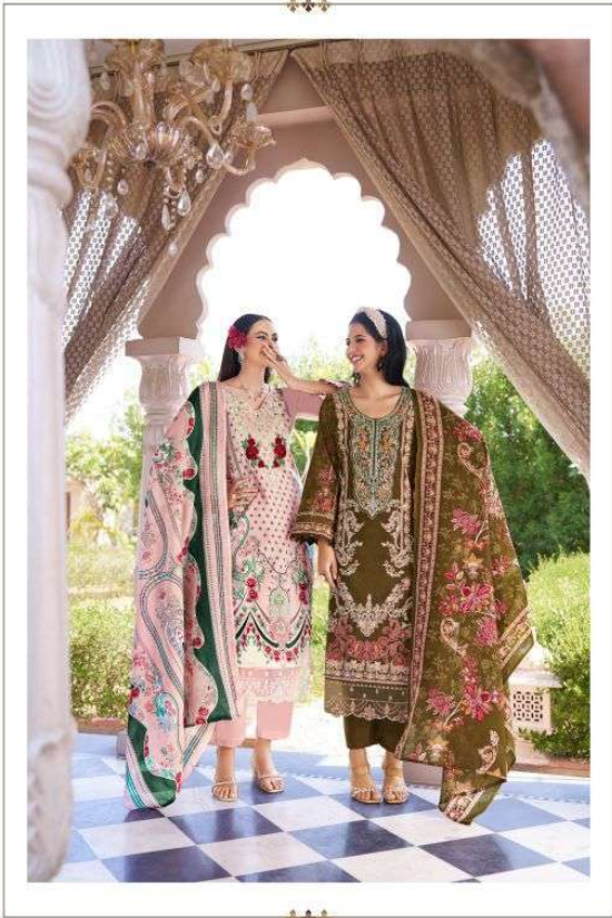
"Fashion you can buy, but style you possess. The key to style is learning who you are, which takes years. There's no how-to road map to style. It's about self expression and, above all, attitude."