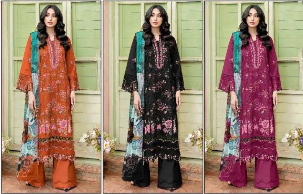
D NO 7182