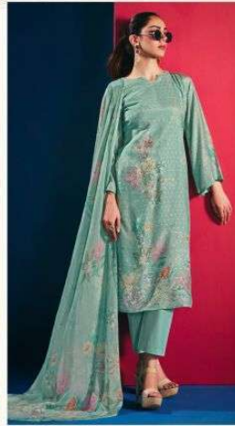
• 1004 •