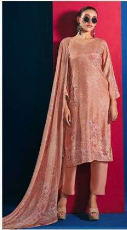
• 1001 •