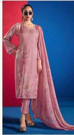
• 1003 •