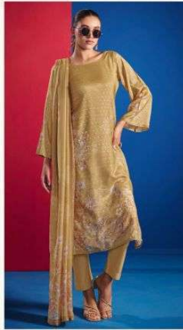
• 1002 •