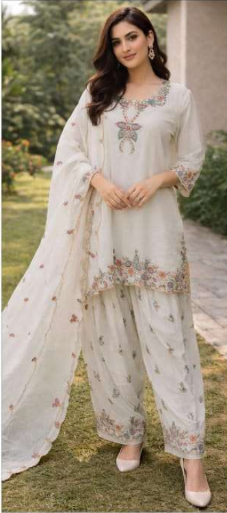
D~ 3464 A