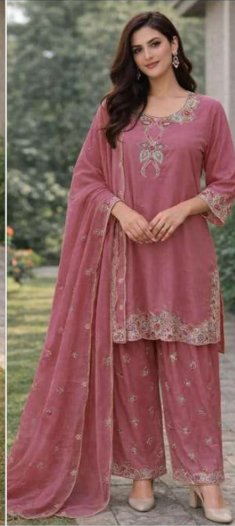
D~ 3464 C