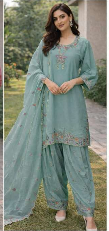
D~ 3464 D