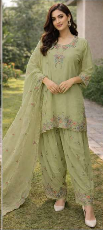
D~ 3464 B