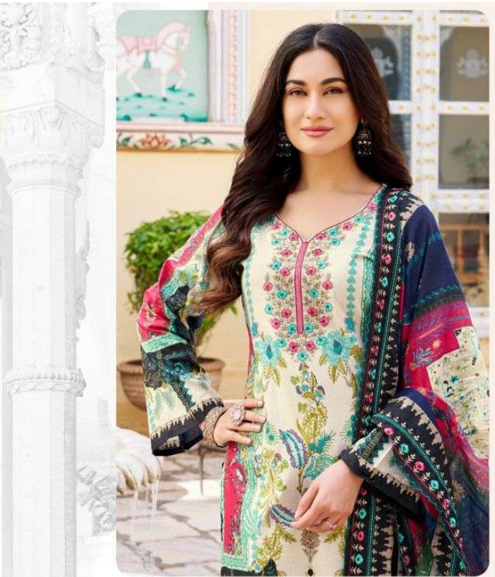
The Art of Everyday Elegance