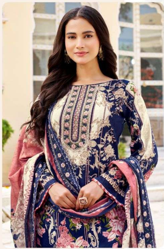
Timeless Looks, Modern Spirit