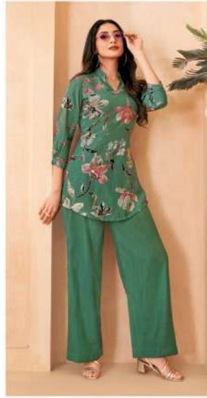
D No. 407