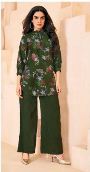
D No. 414