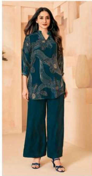
D No. 410