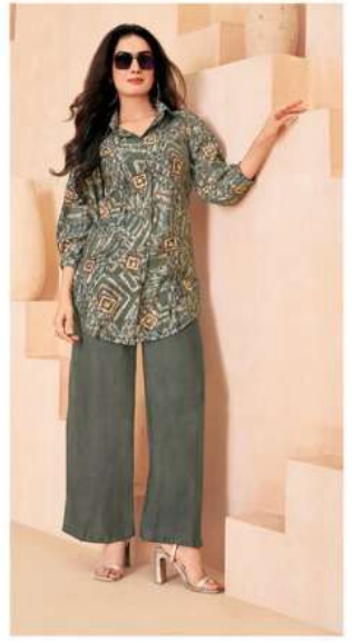
D No. 412