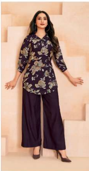
D No. 413