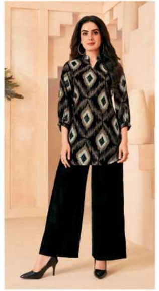
D No. 408