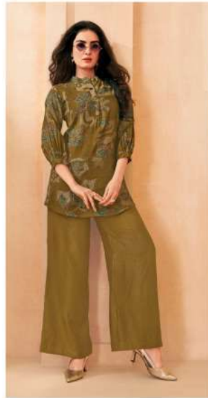
D No. 411