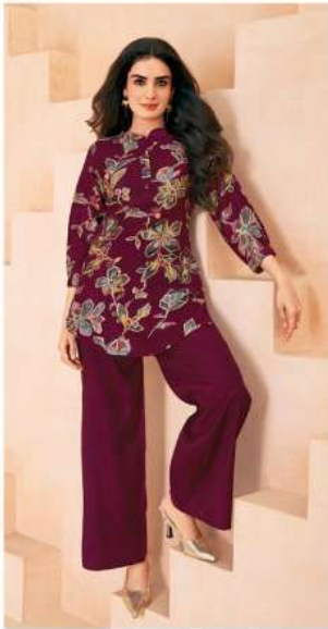
D No. 409