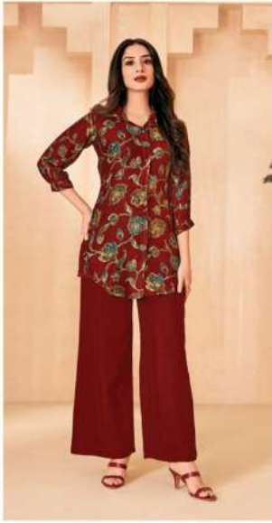
D No. 405