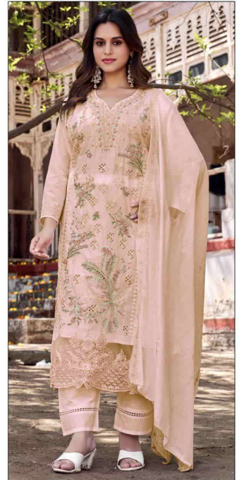
E -29 D