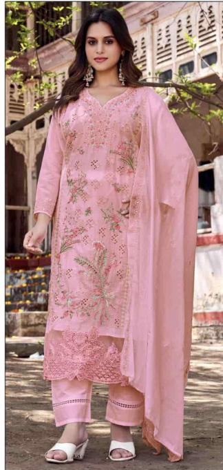
E -29 B