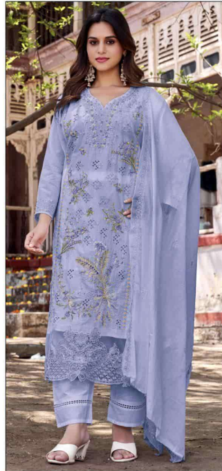
E -29 C