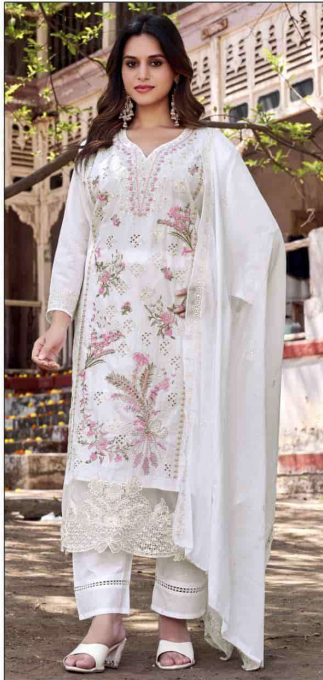
E -29 A

TOP - CAMBRIC LAWN COTTON HEAVY EMBROIDERED WITH PEARLS PANT - CAMBRIC LAWN COTTON DUPATTA - MAL COTTON EMBROIDERED