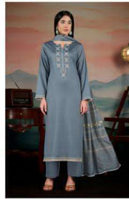
NE-C 2127 E