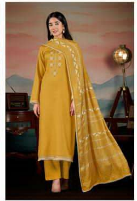
NE-C 2127 F