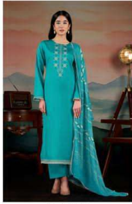
NE-C 2127 B