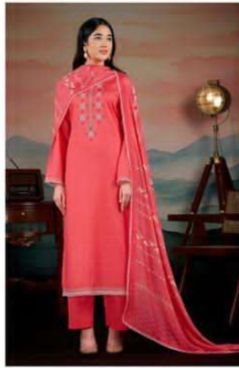
NE-C 2127 D