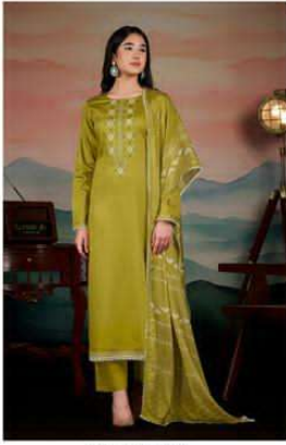
NE-C 2127 A