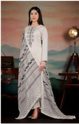
NE-C 2127 C