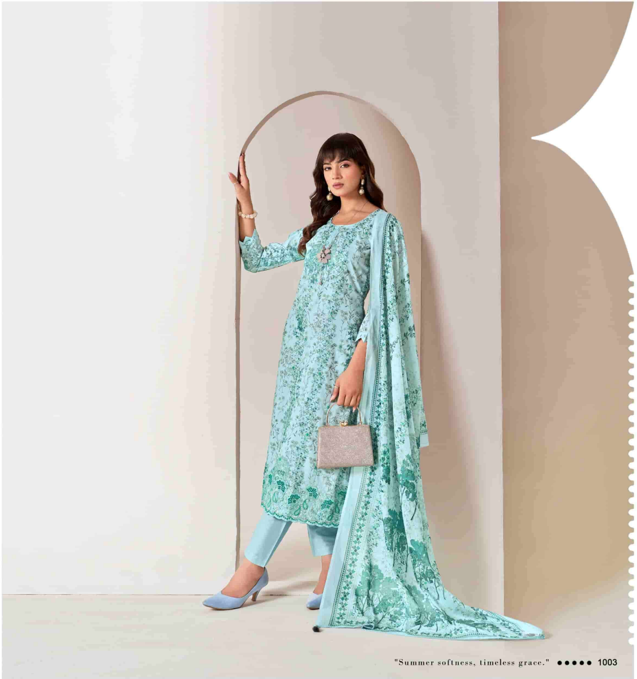
"Summer softness, timeless grace." ●●●●● 1003