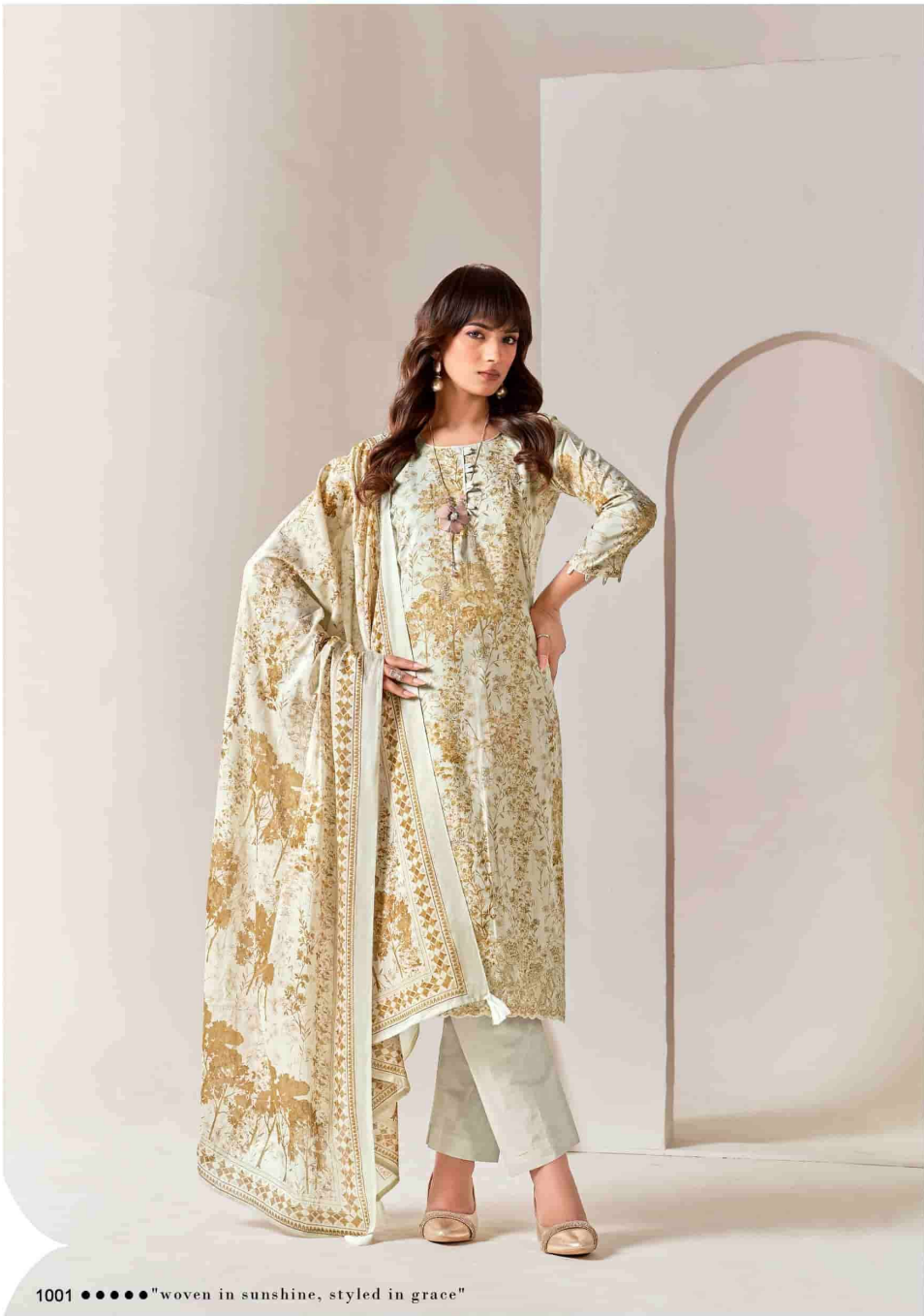
1001 ●●●●● "woven in sunshine, styled in grace"