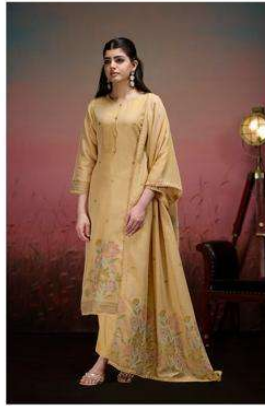
NE-C 2144 D