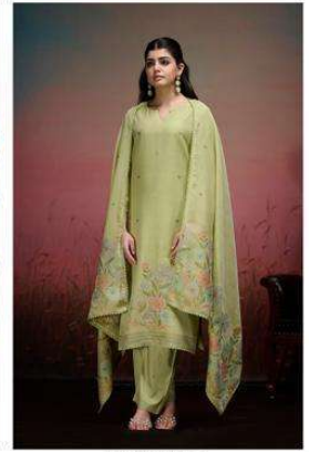
NE-C 2144 F