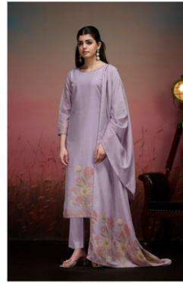
NE-C 2144 E