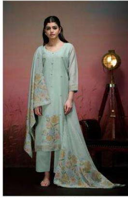
NE-C 2144 B