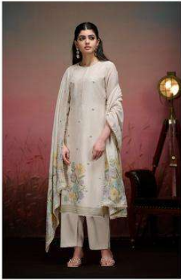
NE-C 2144 C