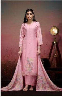
NE-C 2144 A