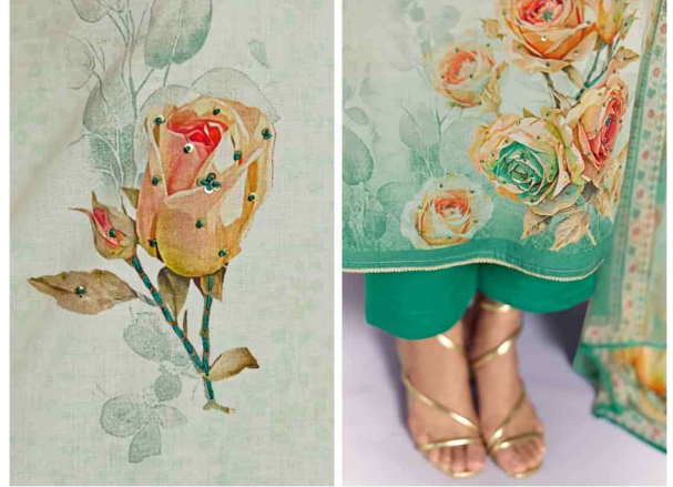
Flowing like a breeze under a clear sky, this ensemble carries the essence of summer in its prettiest, most graceful form.