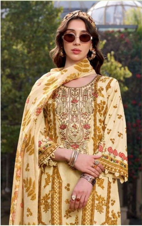
Grandeur without weight dramatic silhouette with gentle balance bold lines soft finishes a garment that commands attention quietly royalty without effort.