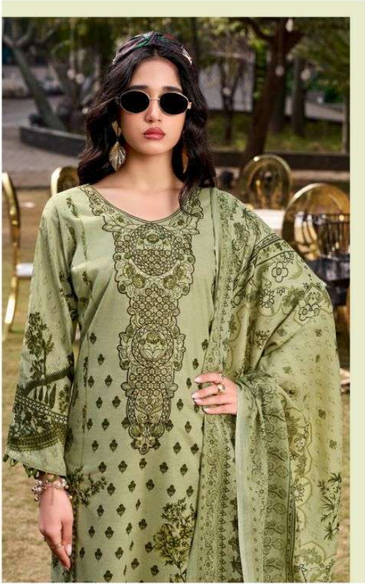
Clean edges with regal intention luxury whispers through fine textures every detail is placed with purpose designed for those who value refined taste.