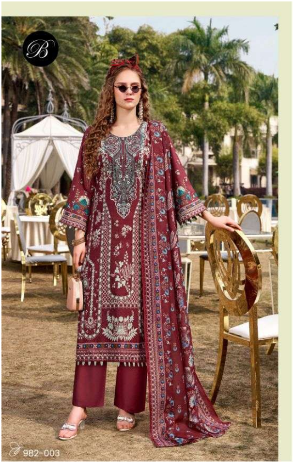
Modern lines polished with subtle sophistication every thread reflects the spirit of the city balanced shapes designed for movement and comfort.