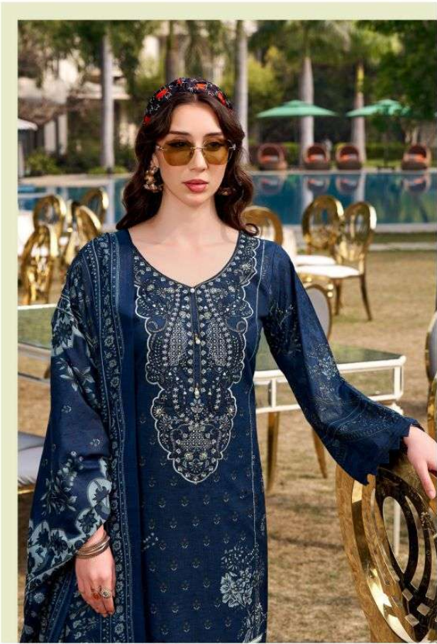
A silhouette born from tradition and elevated for today soft textures create a gentle rhythm with every move crafted to suit quiet moments and bold entrances alike.