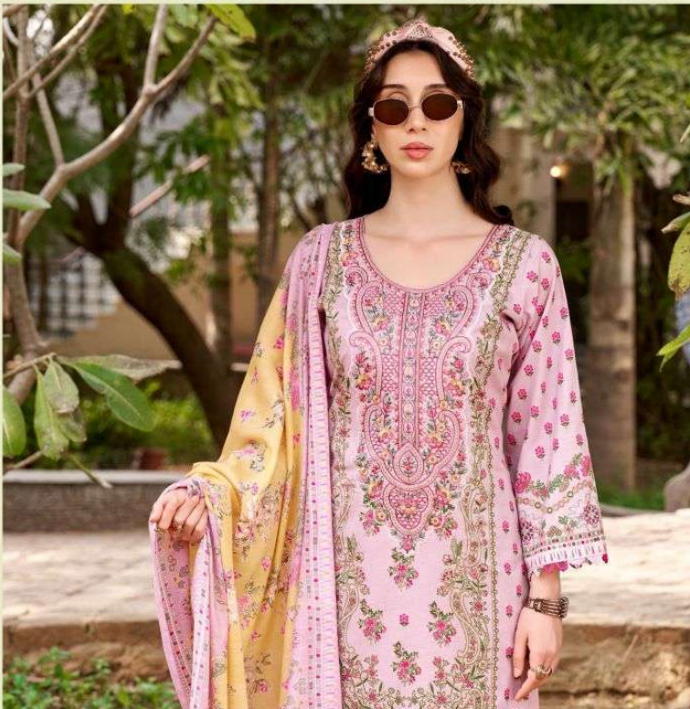
Comfort meets couture in perfect harmony lightweight materials shaped for daily wear uncomplicated design with lasting appeal from morning meetings to evening dinners.