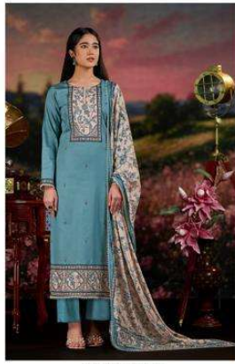
NE-C 2165 B