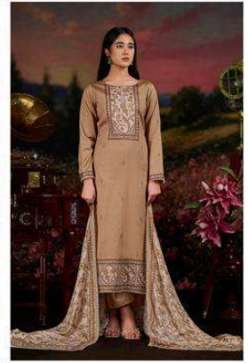
NE-C 2165 F