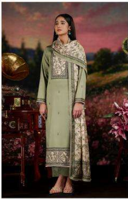
NE-C 2165 C