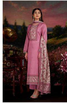
NE-C 2165 E