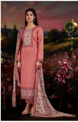
NE-C 2165 A