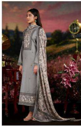
NE-C 2165 D