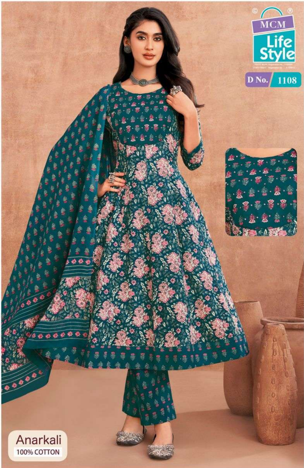
Anarkali 100% COTTON