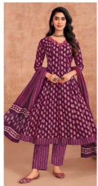
D No. 1116