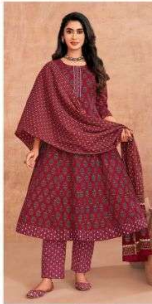
D No. 1112