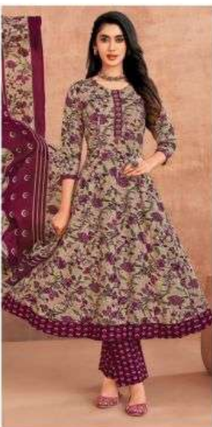
D No. 1115