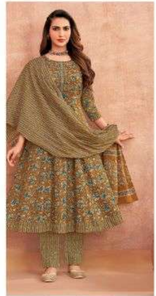
D No. 1114