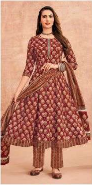
D No. 1107