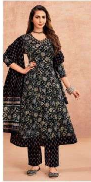
D No. 1109