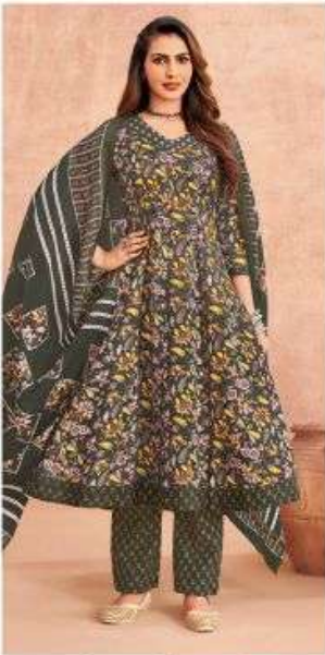
D No. 1111