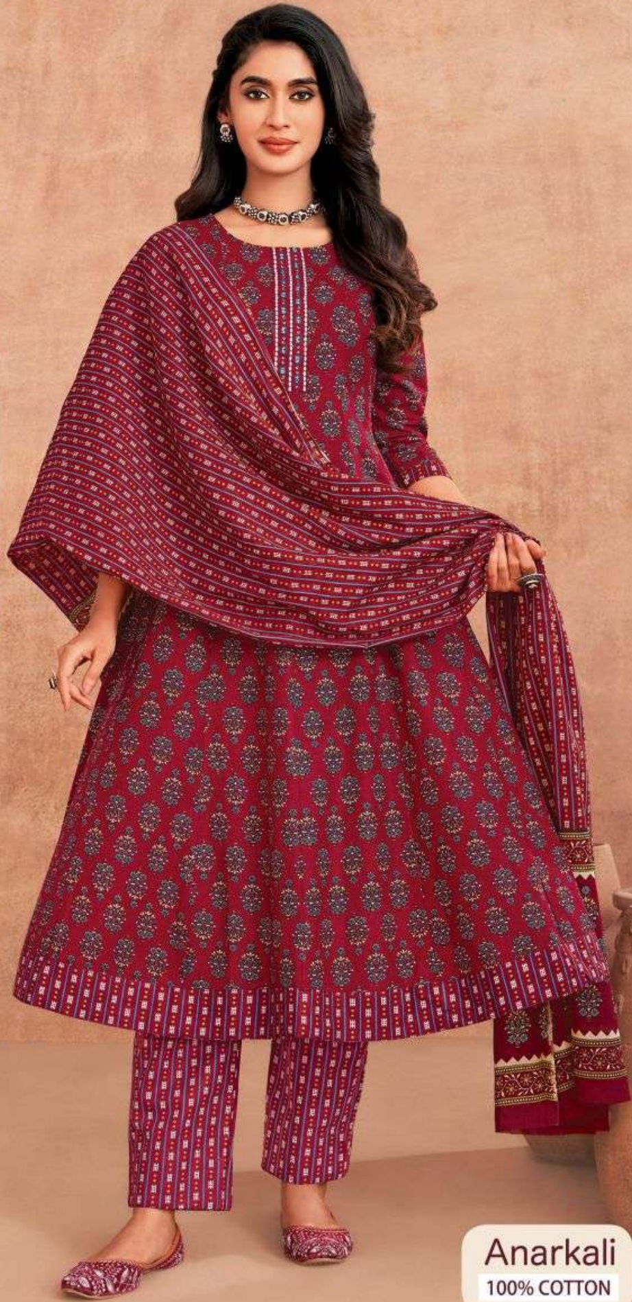
Anarkali 100% COTTON