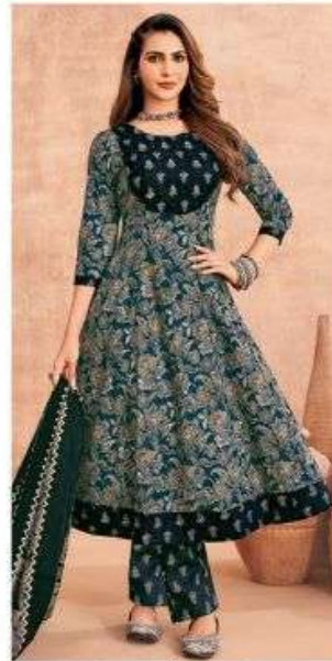
D No. 1113