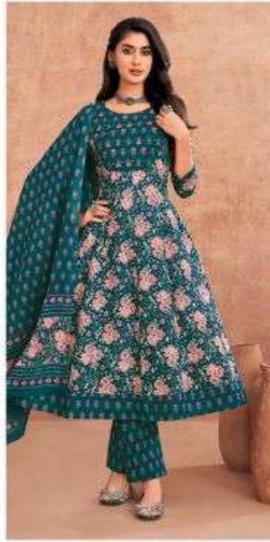
D No. 1108