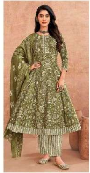
D No. 1110