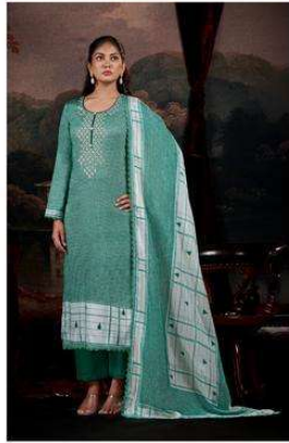
NE-C 2156 D