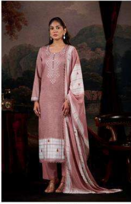
NE-C 2156 A