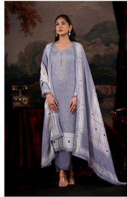
NE-C 2156 E