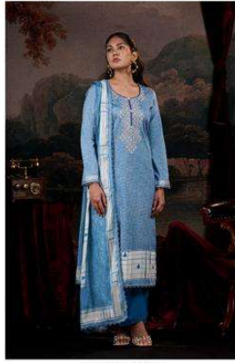
NE-C 2156 B