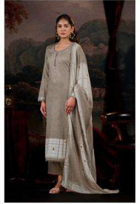
NE-C 2156 F