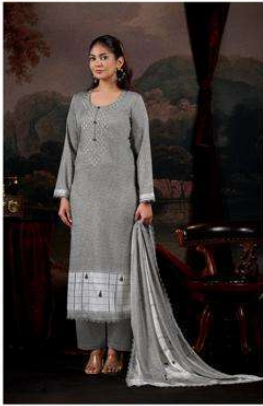
NE-C 2156 C