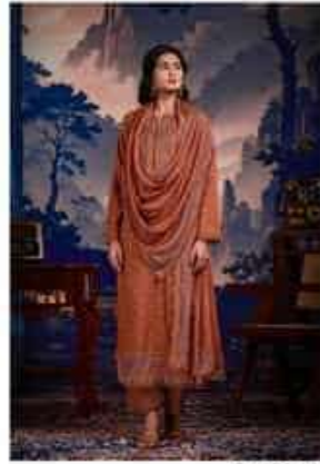
D.NO 2128 E