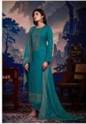
D.NO 2128 D