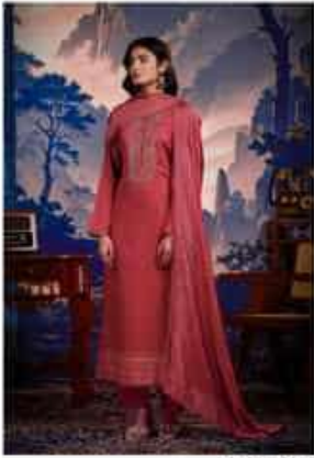
D.NO 2128 C