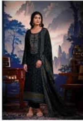
D.NO 2128 B