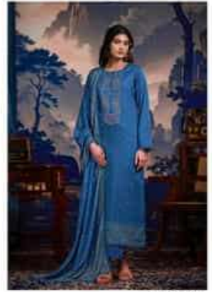
D.NO 2128 F