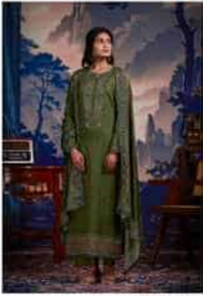
D.NO 2128 A