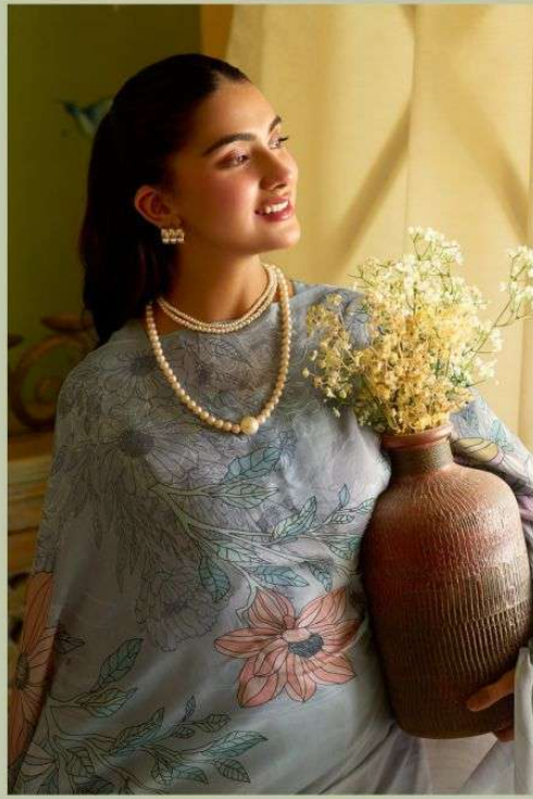
The 'Vidua.' An unforgettable look for an unforgettable night.