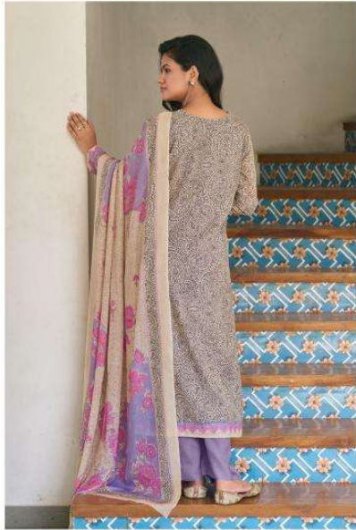
A round up of the hottest trends this spring seasons you the chicest ways to wear pastels prints.

FASHION FORWARD STIMAR ® GLAMOUR & GLITTERS