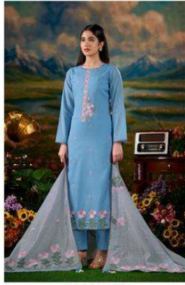
NE-C 2143 B