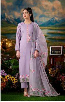
NE-C 2143 A