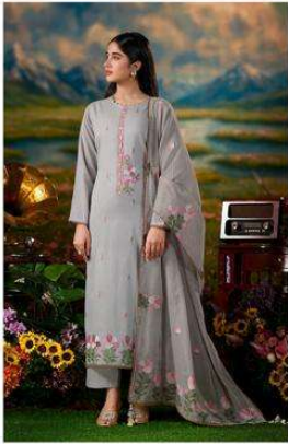
NE-C 2143 C