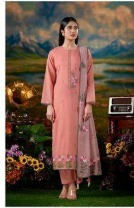
NE-C 2143 E