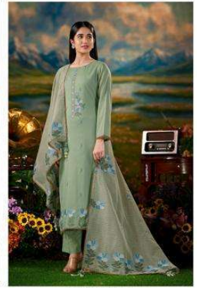
NE-C 2143 F