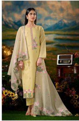
NE-C 2143 D