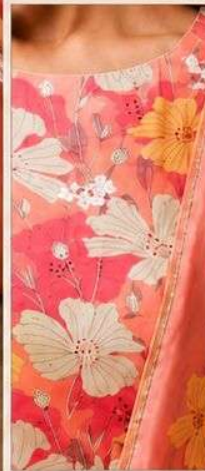
Digital Print with Embroidery