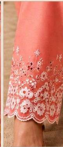
Fancy Embroidery Work