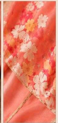
Digital Print Dupatta