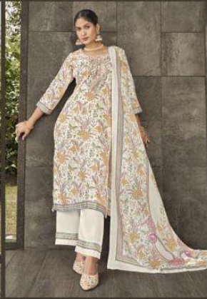
3687 B ❖