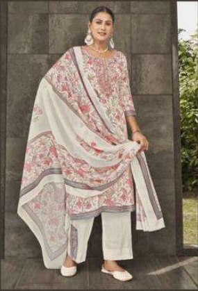
3687 A ❖