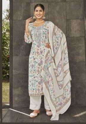
3685 B ❖