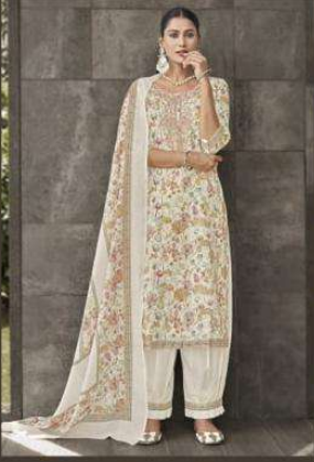
3685 A ❖