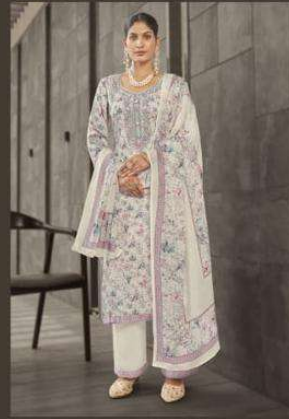
3688 A ❖