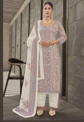
3686 A ❖