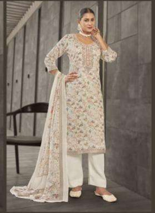
3688 B ❖