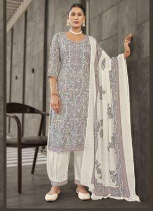
3686 B ❖