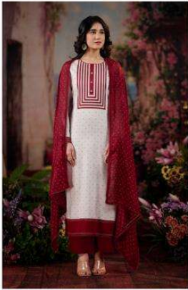
NE-C 2172 C