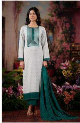
NE-C 2172 D