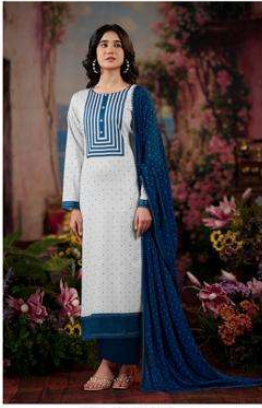
NE-C 2172 A