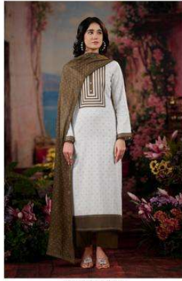
NE-C 2172 B