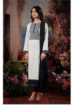
NE-C 2172 F