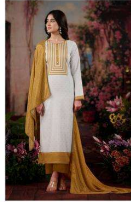
NE-C 2172 E