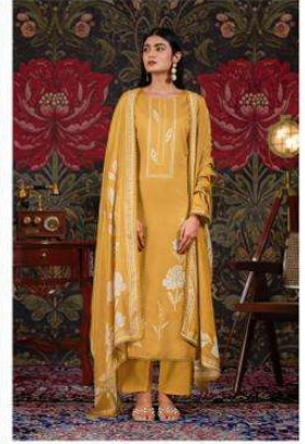
NE-C 2171 F