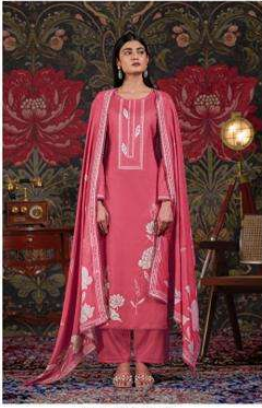
NE-C 2171 A