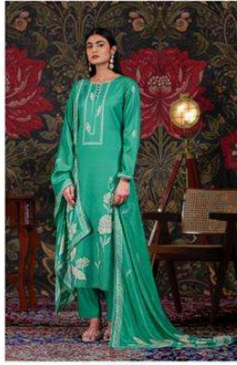
NE-C 2171 B