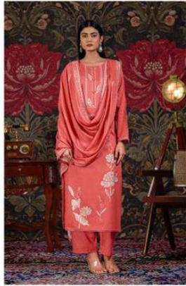
NE-C 2171 D