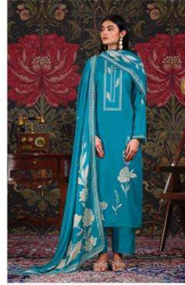
NE-C 2171 E