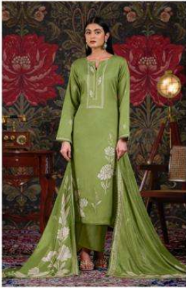
NE-C 2171 C