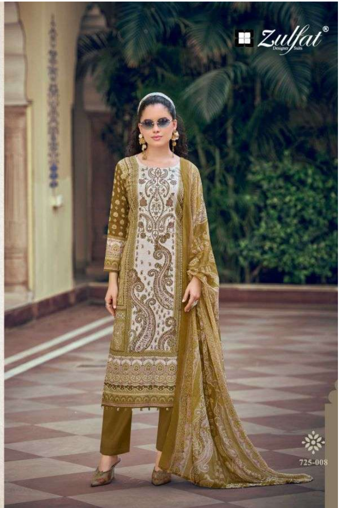
Indulge in pure elegance with this embroidered dress carved amid intricate detailing, fuses your ethnic style!