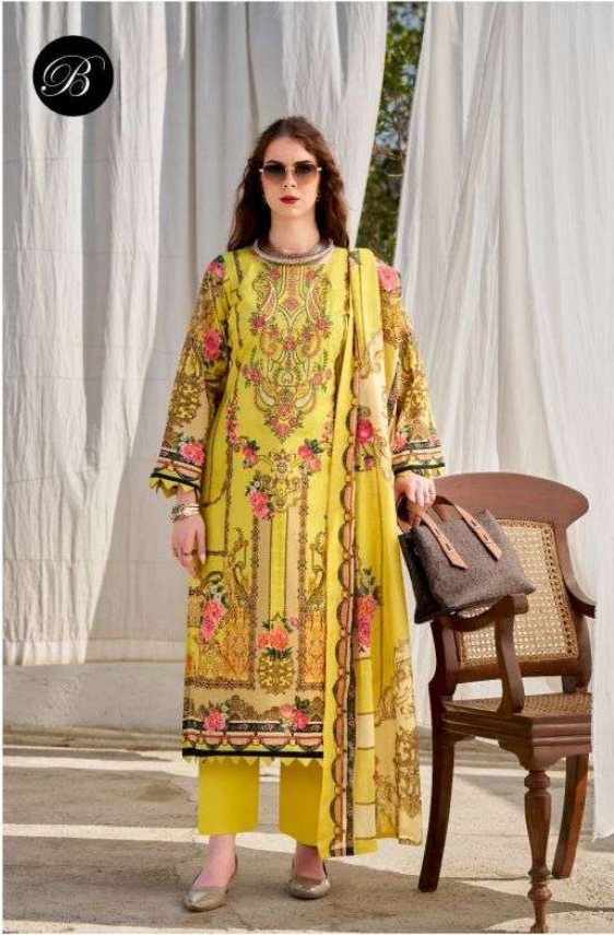
Defined silhouettes create presence precision sharpens overall appeal. 987-008