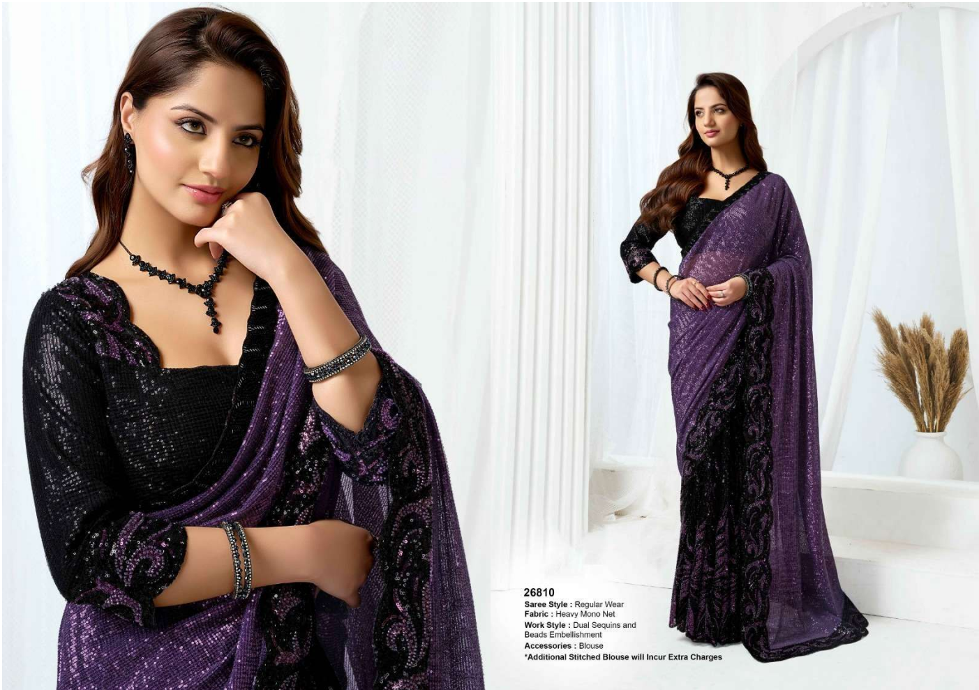
26810 Saree Style : Regular Wear Fabric : Heavy Mono Net Work Style : Dual Sequins and Beads Embellishment Accessories : Blouse *Additional Stitched Blouse will Incur Extra Charges