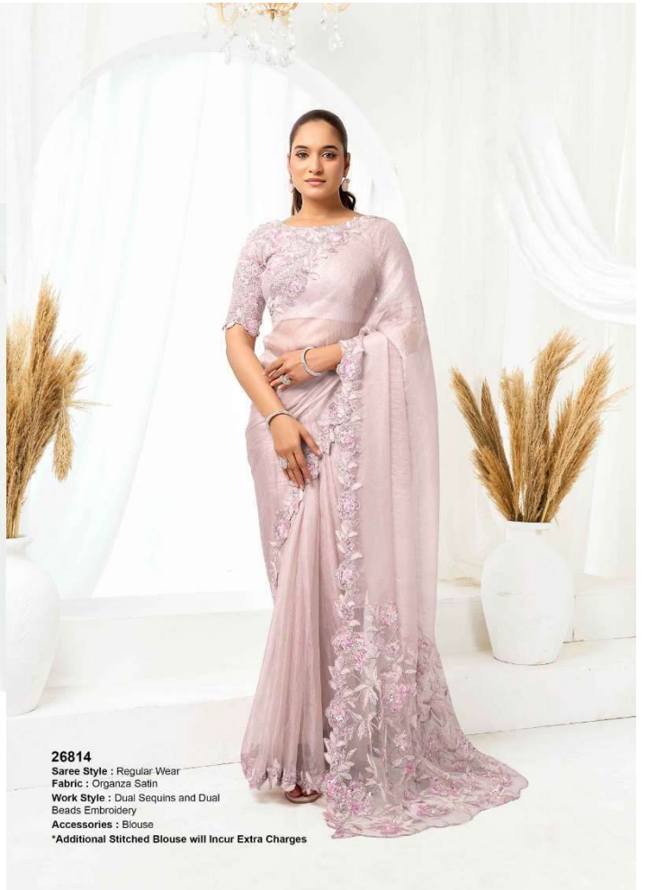
26814 Saree Style : Regular Wear Fabric : Organza Satin Work Style : Dual Sequins and Dual Beads Embroidery Accessories : Blouse *Additional Stitched Blouse will Incur Extra Charges