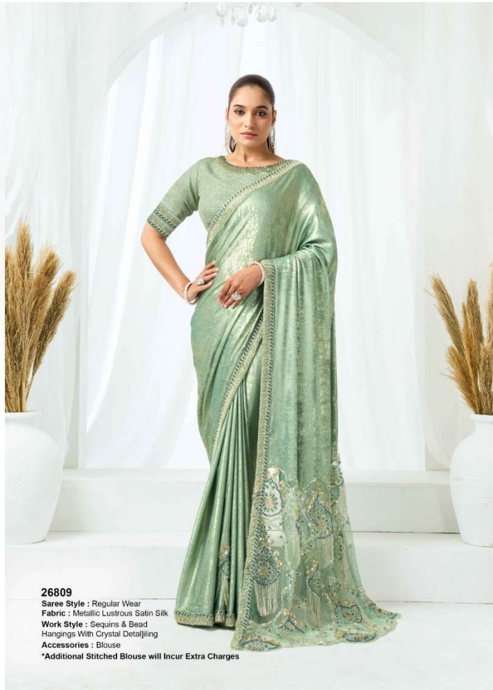
26809 Saree Style : Regular Wear Fabric : Metallic Lustrous Satin Silk Work Style : Sequins & Bead Hangings With Crystal Detailling Accessories : Blouse *Additional Stitched Blouse will Incur Extra Charges