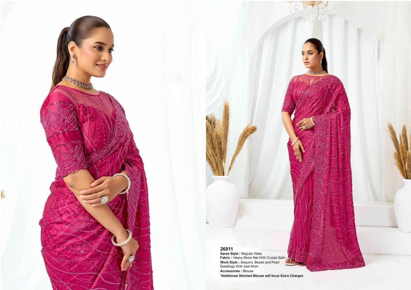
26811 Saree Style : Regular Wear Fabric : Heavy Mono Net With Crystal Satin Work Style : Sequins, Beads and Pearl Detailings With Jaal Work Accessories : Blouse *Additional Stitched Blouse will Incur Extra Charges