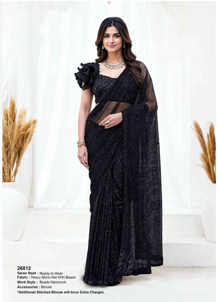
26812 Saree Style : Ready to Wear Fabric : Heavy Mono Net With Beads Work Style : Beads Handwork Accessories : Blouse *Additional Stitched Blouse will Incur Extra Charges