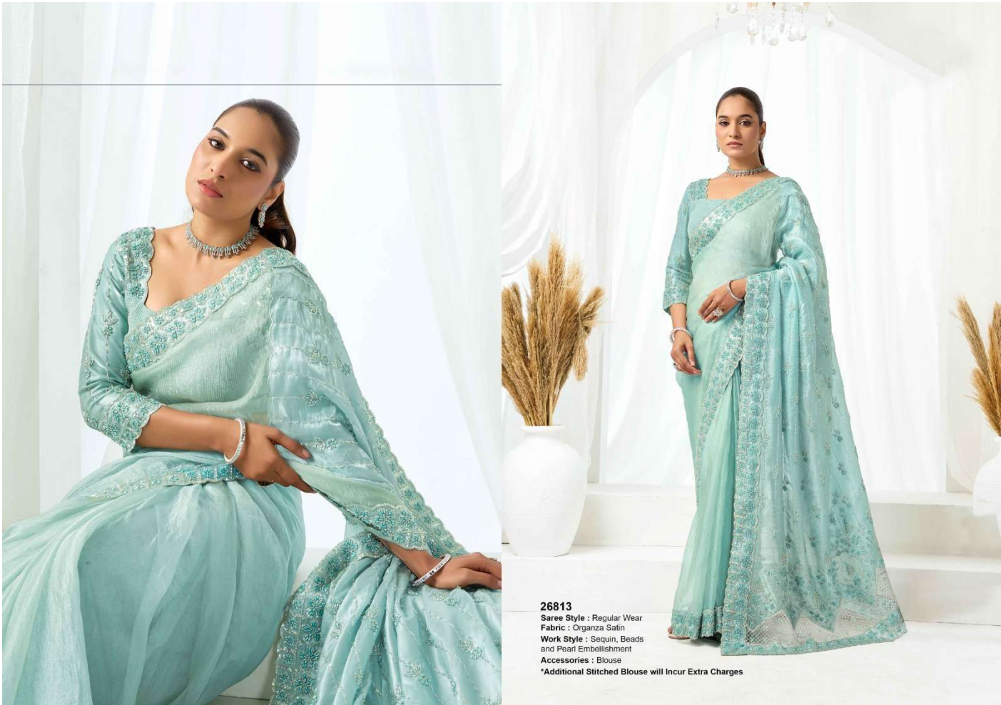
26813 Saree Style : Regular Wear Fabric : Organza Satin Work Style : Sequin, Beads and Pearl Embellishment Accessories : Blouse *Additional Stitched Blouse will Incur Extra Charges