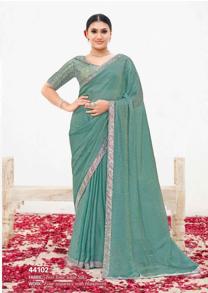
44102 FABRIC: Two Tone Satin Silks WORK: Four sequence with Handwork