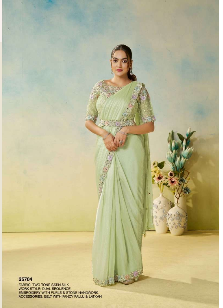
25704 FABRIC: TWO TONE SATIN SILK WORK STYLE: DUAL SEQUENCE EMBROIDERY WITH PURLS & STONE HANDWORK ACCESSORIES: BELT WITH FANCY PALLU & LATKAN