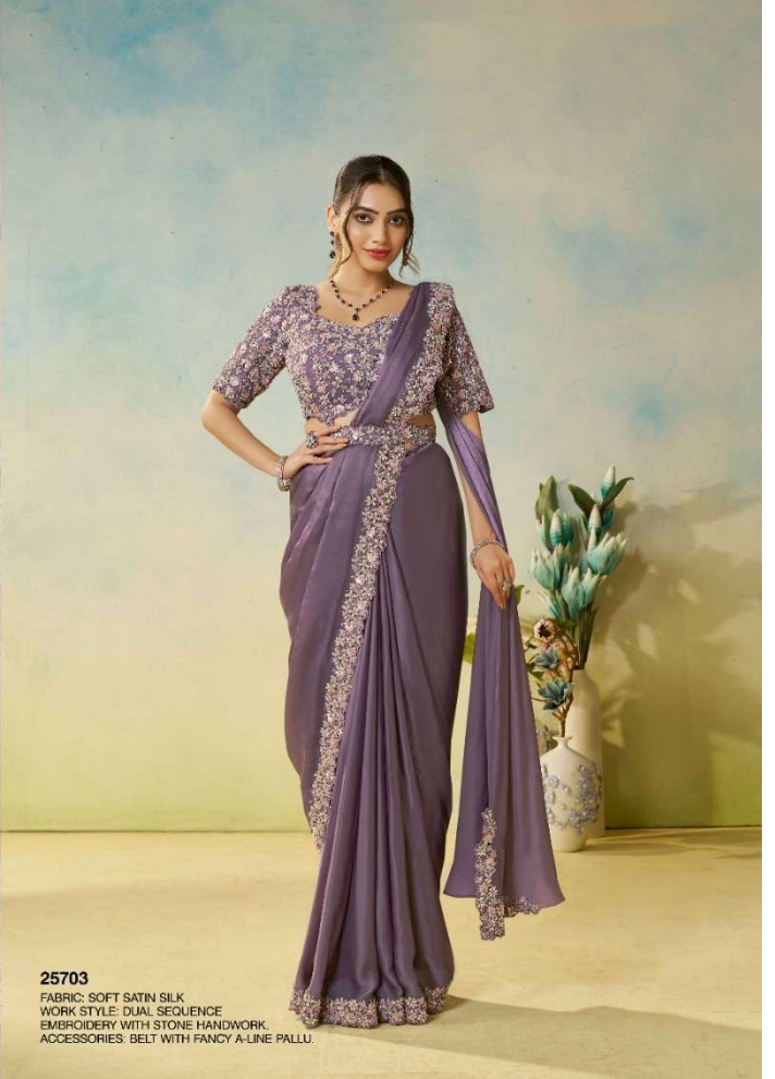
25703 FABRIC: SOFT SATIN SILK WORK STYLE: DUAL SEQUENCE EMBROIDERY WITH STONE HANDWORK. ACCESSORIES: BELT WITH FANCY A-LINE PALLU.