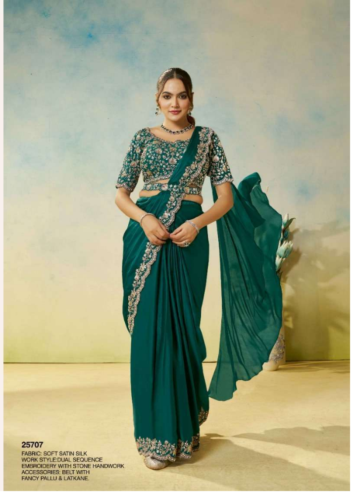
25707 FABRIC: SOFT SATIN SILK WORK STYLE: DUAL SEQUENCE EMBROIDERY WITH STONE HANDWORK. ACCESSORIES: BELT WITH FANCY PALLU & LATKANE.