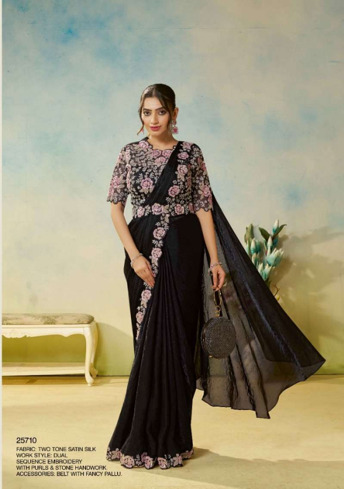
25710 FABRIC: TWO TONE SATIN SILK WORK STYLE: DUAL SEQUENCE EMBROIDERY WITH PURLS & STONE HANDWORK. ACCESSORIES: BELT WITH FANCY PALLU.