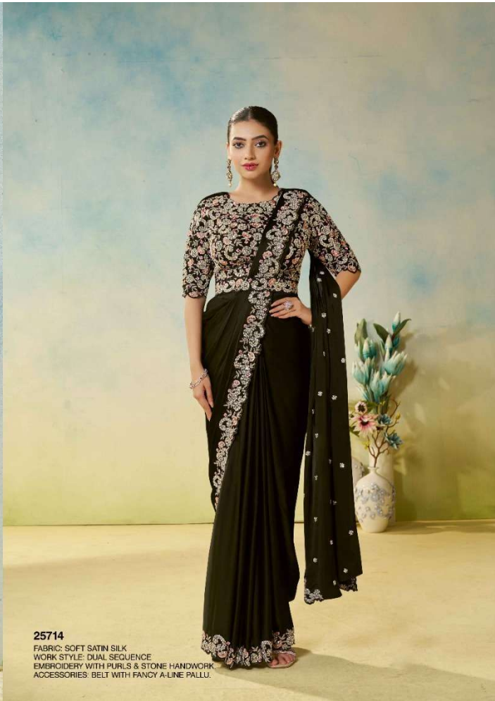
25714 FABRIC: SOFT SATIN SILK WORK STYLE: DUAL SEQUENCE EMBROIDERY WITH PURLS & STONE HANDWORK ACCESSORIES: BELT WITH FANCY A-LINE PALLU.