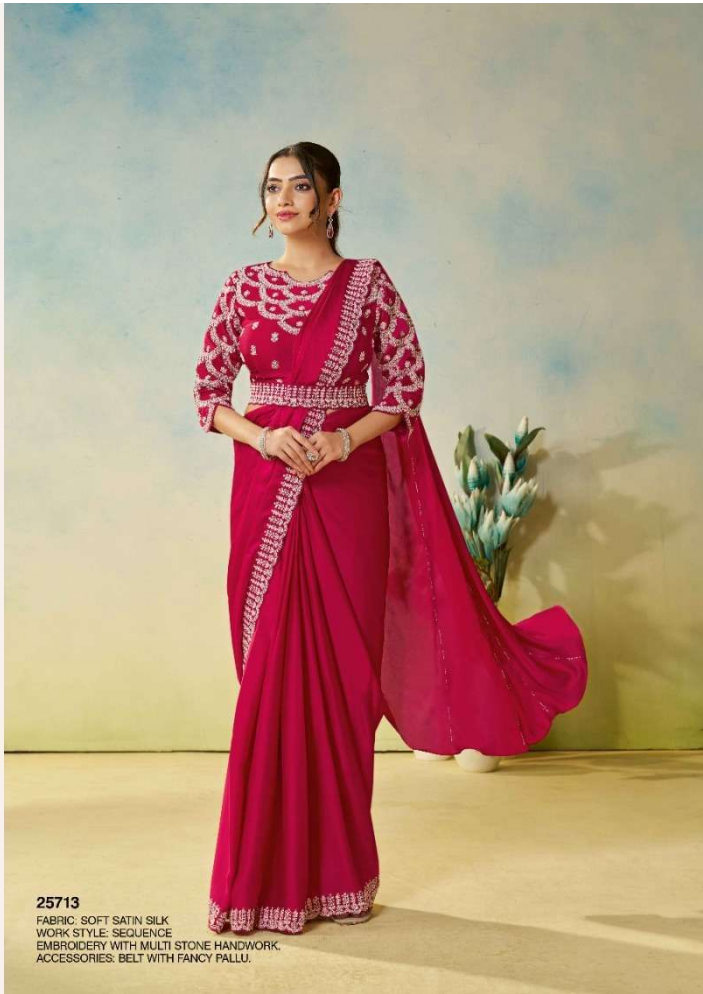
25713 FABRIC: SOFT SATIN SILK WORK STYLE: SEQUENCE EMBROIDERY WITH MULTI STONE HANDWORK. ACCESSORIES: BELT WITH FANCY PALLU.