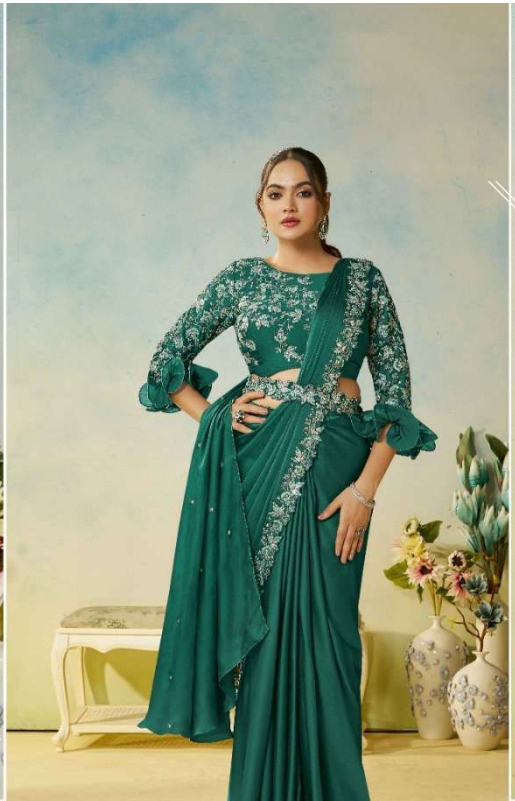
25705 FABRIC: SIFFONE SATIN SILK WORK STYLE: SEQUENCE EMBROIDERY WITH STONE HANDWORK ACCESSORIES: BELT WITH FANCY PALLU.