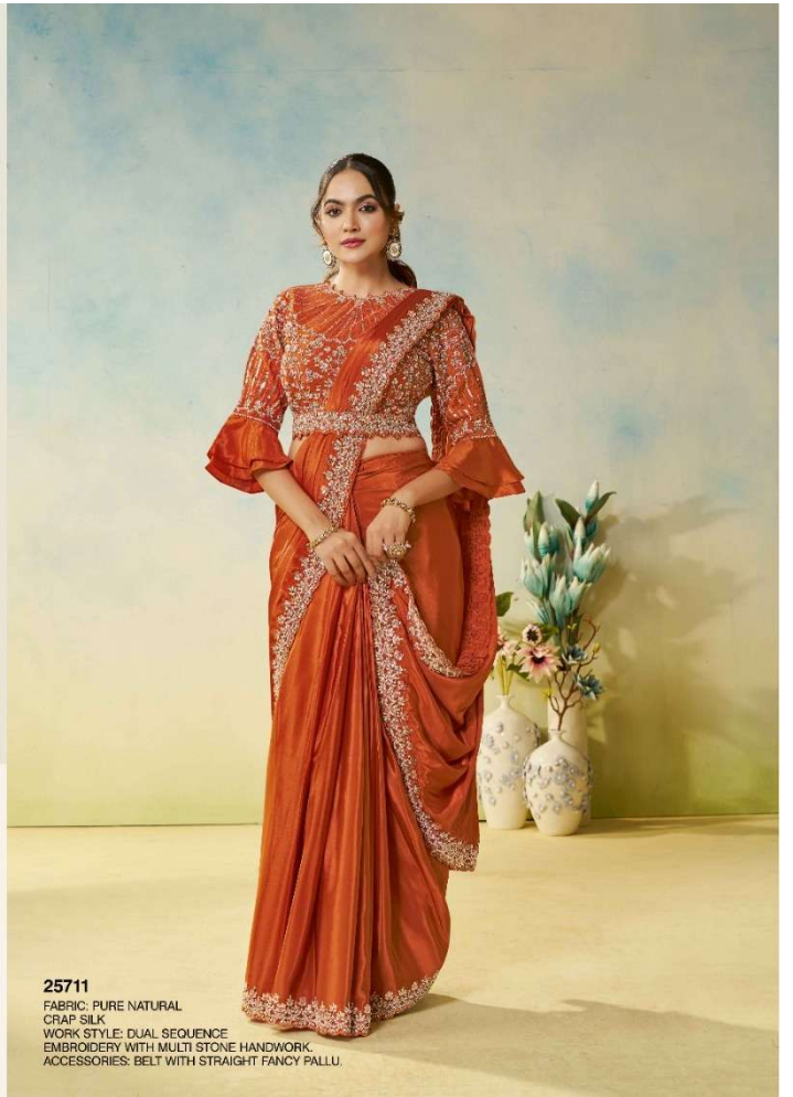
25711 FABRIC: PURE NATURAL CRAP SILK WORK STYLE: DUAL SEQUENCE EMBROIDERY WITH MULTI STONE HANDWORK, ACCESSORIES: BELT WITH STRAIGHT FANCY FALLU.