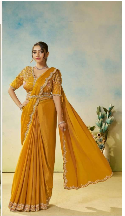
25702 FABRIC: SOFT SATIN SILK WORK STYLE: DUAL SEQUENCE EMBROIDERY WITH MULTI STONE HANDWORK. ACCESSORIES: BELT WITH FANCY PALLU.