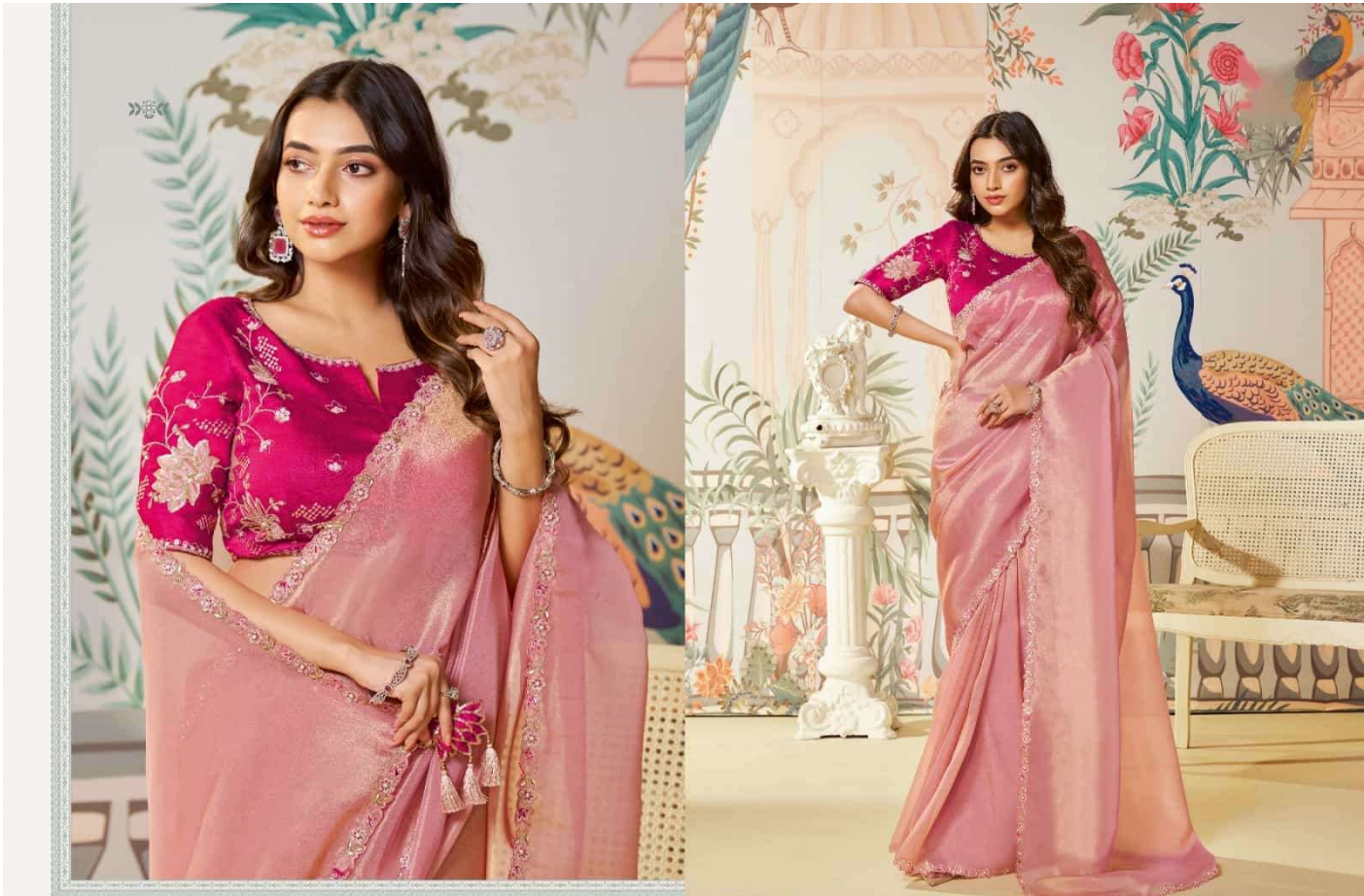
44308 FABRIC: ZARI ORGANZA SILK WORK: DUAL SEQUENCE EMBROIDERY WITH APPLIQUE WORK