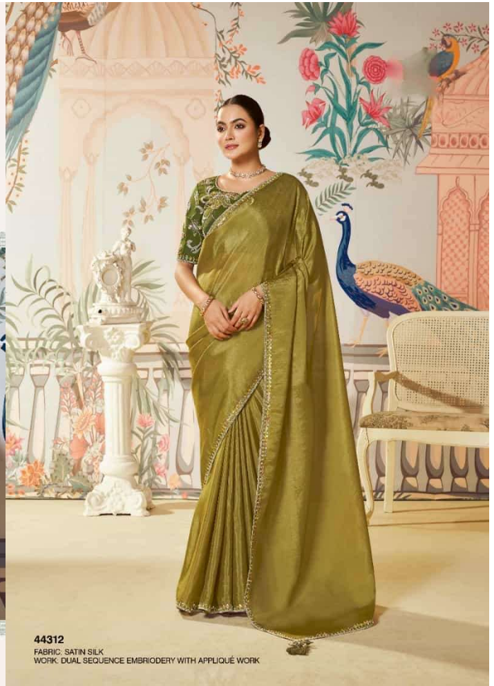
44312 FABRIC: SATIN SILK WORK: DUAL SEQUENCE EMBROIDERY WITH APPLIQUÉ WORK