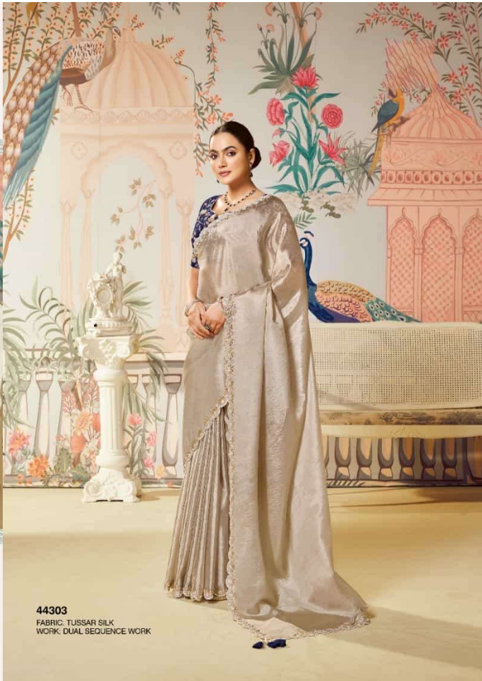
44303 FABRIC: TUSSAR SILK WORK: DUAL SEQUENCE WORK