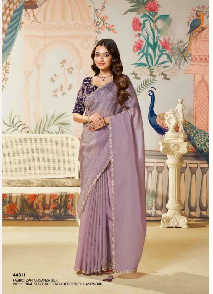
44311 FABRIC: ZARI ORGANZA SILK WORK: DUAL SEQUENCE EMBROIDERY WITH HANDWORK