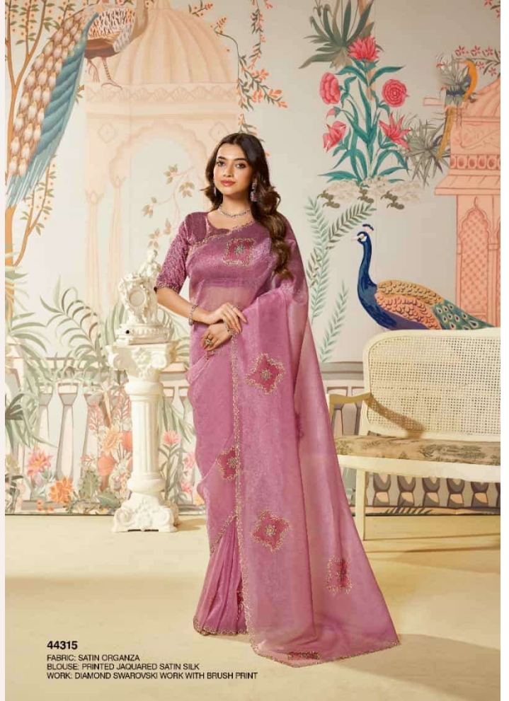
44315 FABRIC: SATIN ORGANZA BLOUSE: PRINTED JAQUARED SATIN SILK WORK: DIAMOND SWAROVSKI WORK WITH BRUSH PRINT