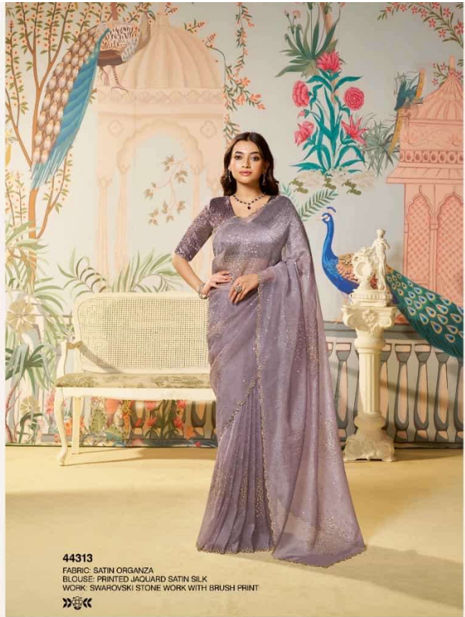
44313 FABRIC: SATIN ORGANZA BLOUSE: PRINTED JACQUARD SATIN SILK WORK: SWAROVSKI STONE WORK WITH BRUSH PRINT