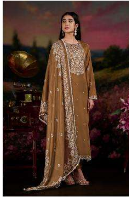
NE-C 2173 D