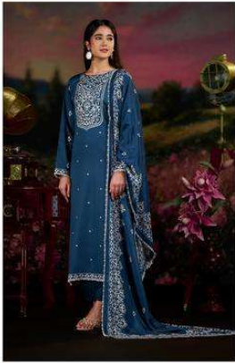
NE-C 2173 C