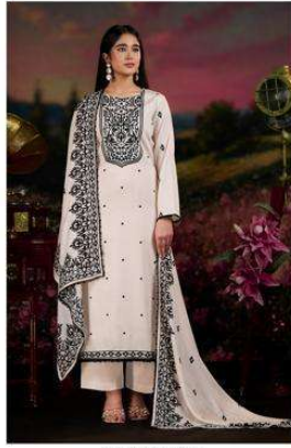
NE-C 2173 B