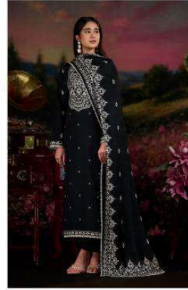
NE-C 2173 E