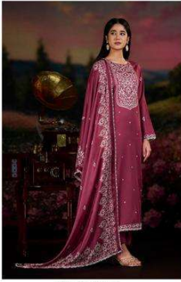
NE-C 2173 A